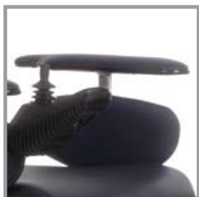
Armrest height can be easily adjusted

The Canto seating system is flexible and modular in construction. The seating system can thus be configured in line with the wishes of users and therapists as regards seating comfort. Comfortable seating, capable of being individually tailored, simple controls and easy redeployment are features of the Canto seating system. The best possible value for money is achieved by using standard components.