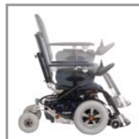
Electric seat lift