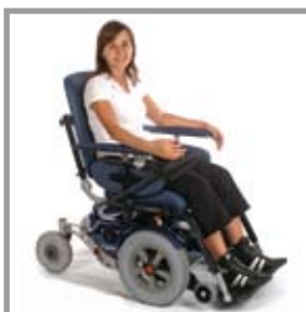
Comfortable seating is a feature of the Canto seating system