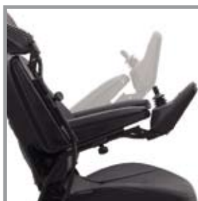
Manually adjustable armrest angle