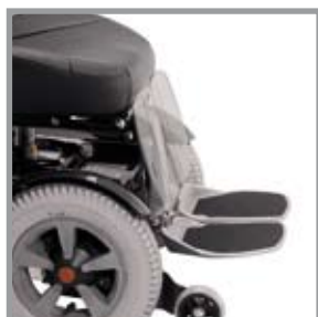
Retractable footrest makes for easy transfers