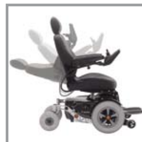
Manually adjustable backrest