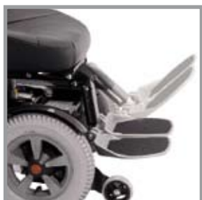
Manually adjustable centre legrest

The CS system provides a comfortable, slightly contoured seat for customers who feel more comfortable and stable with a simple seating system. Several sizes and manual recline are standard and enable this seating system to fulfil the wishes of the most demanding users. The cover material is durable and easy to clean.