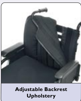
Adjustable Backrest Upholstery

There are a number of different options available to customise this chair to client requirements, which includes a tension adjustable backrest, a range of multi-adjustable legrests, armrests, hub brakes, anti tip device, and optional rear wheel positions. All parts fitted to the frame of the Action 4 HD are interchangeable with the Invacare® Action 3 to help keep down maintenance costs and to provide easier refurbishment.