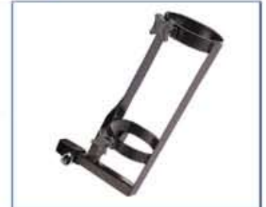
■ Oxygen tank holder