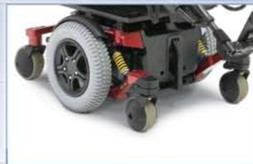
■ OMNI-Casters on front and rear