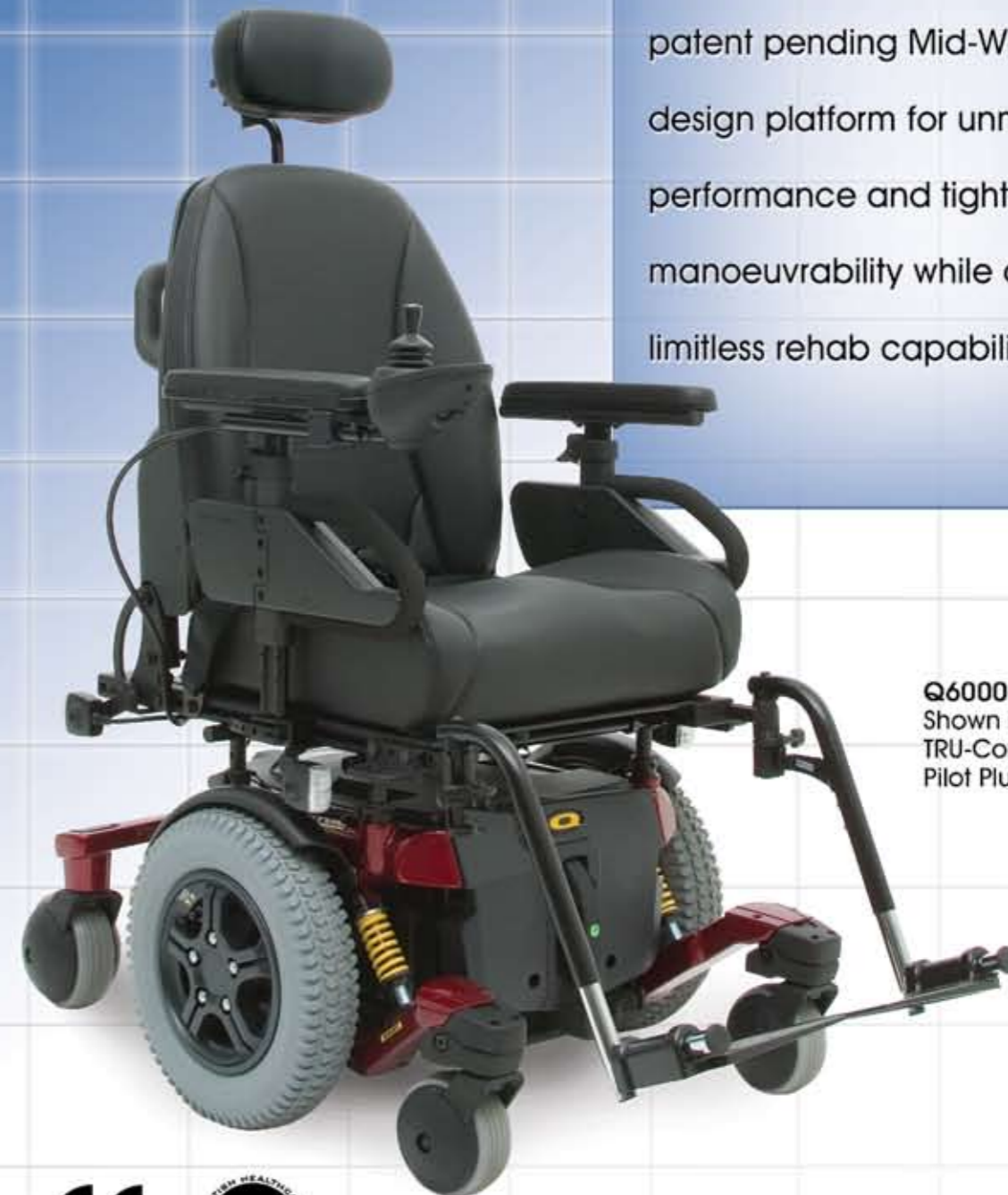
Q6000 Shown in Red with TRU-Comfort ® seat and Pilot Plus controller

Pride Mobility Products Ltd. www.pridemobility.com