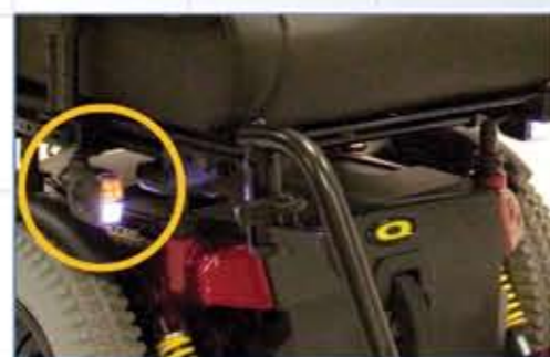
■ New LED Lighting package (shown circled above)