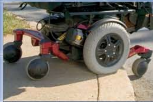
■ Mid-Wheel 6® allows six wheels on the ground for maximum stability