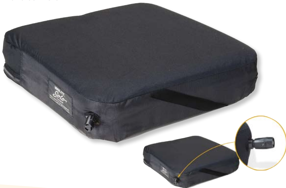
PSV Valve (see p36).

VARILITE offers the Solo and Solo PSV™ for wheelchair users with a risk of tissue breakdown and moderate positioning needs. Therapists recommend the Solo range for individuals with paraplegia, orthopaedic and circulatory issues, as well as for children and the older client. Users value the Solo's low weight, pressure distribution, stability, and comfort.