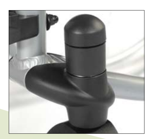
New robust castor attachment offers more rigidity and an improved appearance.