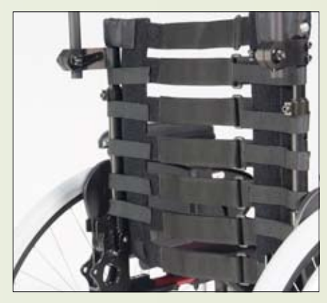
Tension adjustable back sling and back height adjustment (35-50 cm) for optimal active ergonomics and comfort.