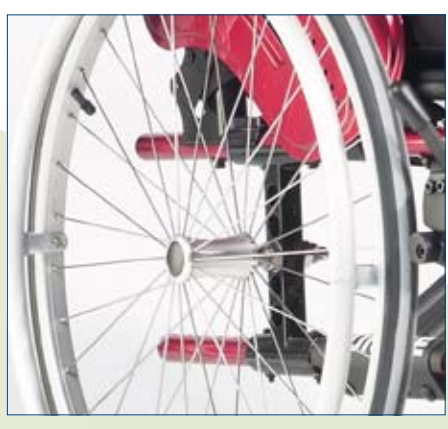
Choice of lightweight stylish wheels, castors and tyres for the more active user.