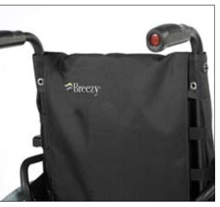
The tension adjustable backrest is now extendable from 41 to 46cm.