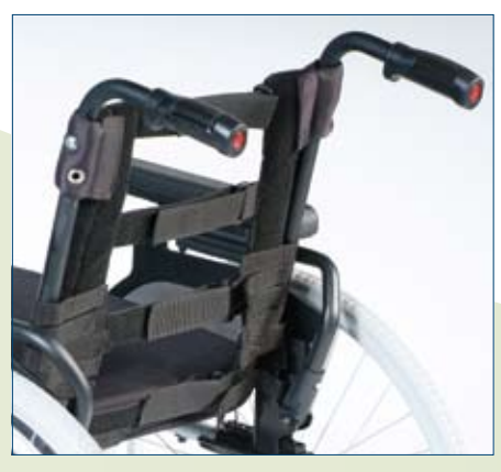
Tension adjustable four strap backrest extendable from 41 to 46cm.