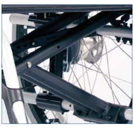
Robust reliable four arm cross brace.