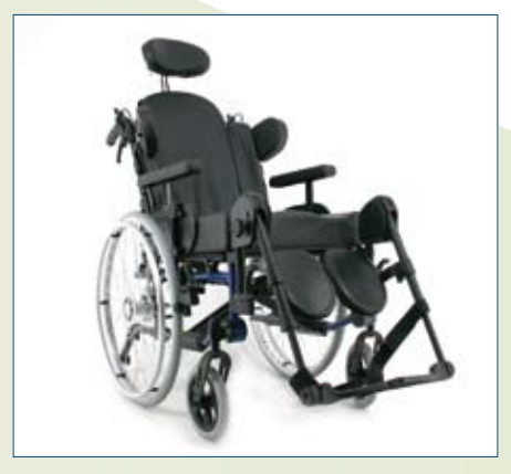
Comfort seat and reclining back (option) for increased sitting tolerance.