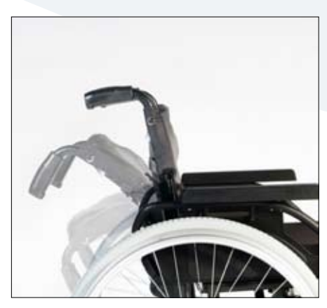
Half folding back