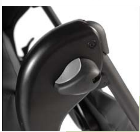
New and improved elevating legrest for increased functionality and improved appearance.