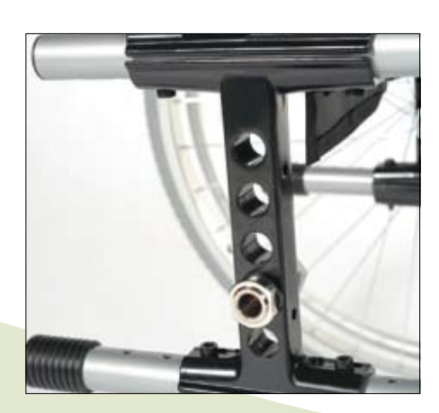
New improved frame offers more seat depth adjustment (41 to 46cm).