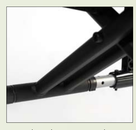
New robust three arm cross brace.