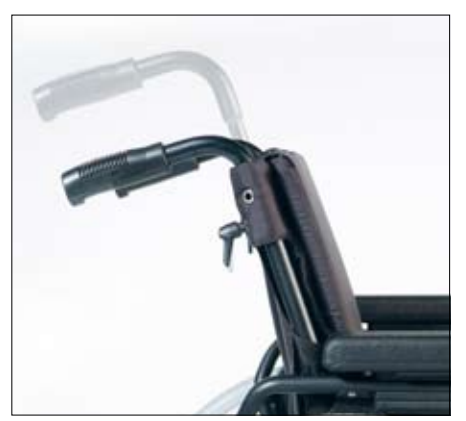
Height adjustable push handles

The X Family<sup>2</sup> comes with a wide range of options, settings and adjustments.