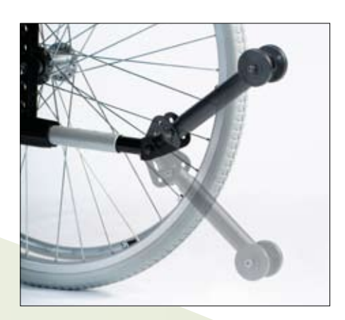
Anti-tips (swing-away, adjustable)