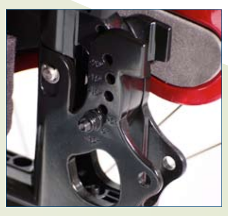
Angle adjustable back to match active and semi-active user requirements (option).