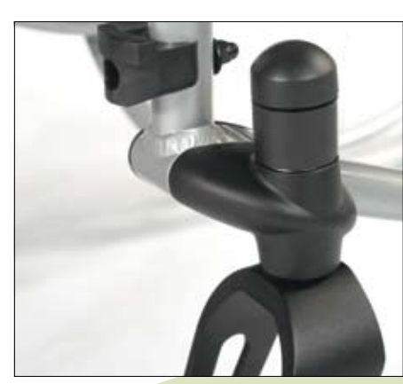
A new robust castor attachment offers more rigidity and an improved appearance.