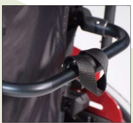
Foldable stabilizer bar