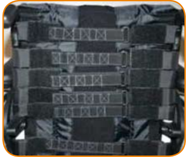
Tension Adjustable Upholstery (TAU)