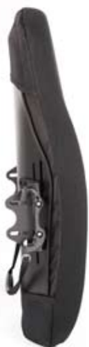
Shallow Contour: Mild lateral trunk support