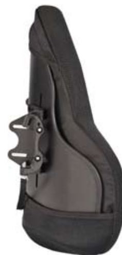
Posterior Deep Contour: Low lateral trunk support