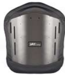
Mid Thoracic, 38 cm

3 Levels of support Available in three different heights to match the clients function and desired level of support, right from the more active (Mid thoracic) to passive wheelchair users (Shoulder height).