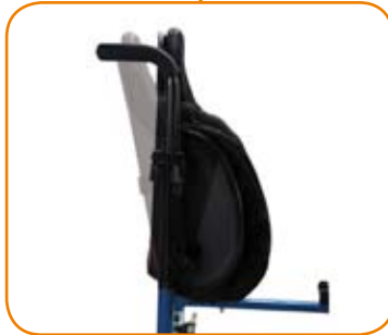
J2 Solid Back