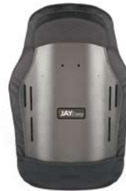
Shoulder Height, 53 cm