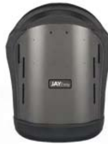
Upper Thoracic, 46 cm