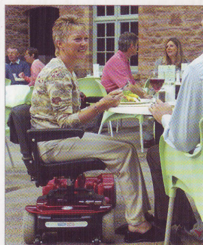
Swivel seat for ease of access

The Rascal Taxi 3 offers all the benefits of a 4 wheel plus additional legroom and manoeuvrability. Available in red and silver.