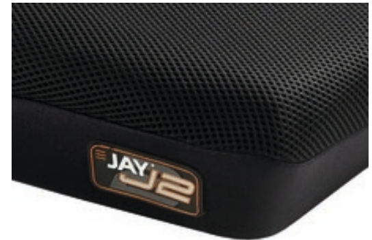
3DX Microclimatic - Breathable material promoting airflow, dissipating heat and moisture