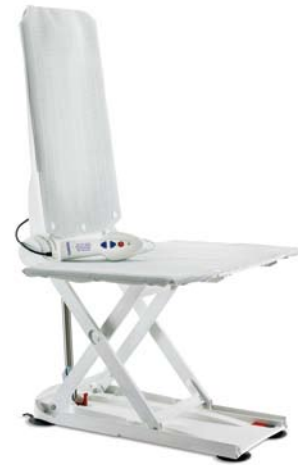
Aquatec Orca F

An upright bath lift with a fixed backrest, that offers support for those who prefer to bathe upright. The integrated head support of the high backrest ensures a safe and comfortable bath.