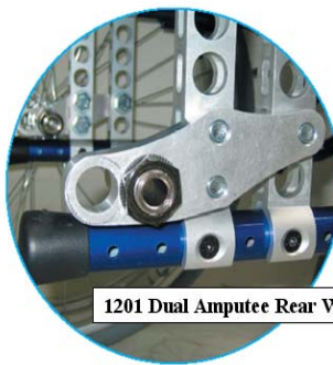
1201 Dual Amputee Rear Wheel Set Back Position

1190 Standard Rear Wheel Position 1200 Passive Rear Wheel Position