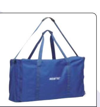
Transport bag with castors for Aquatec® Beluga and Aquatec® Orca Bath Lifts.