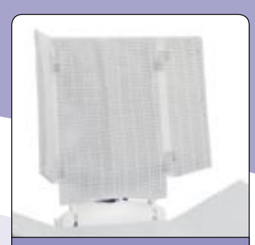
Reclining special backrest Aquatec® Beluga