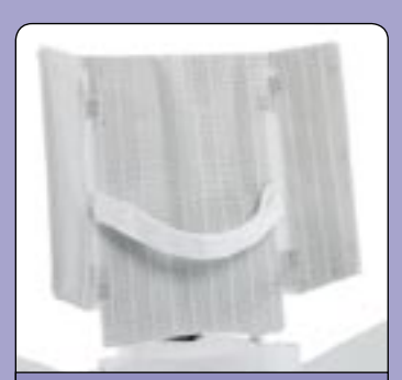
Beluga chest belt in white Beluga pelvis belt in white