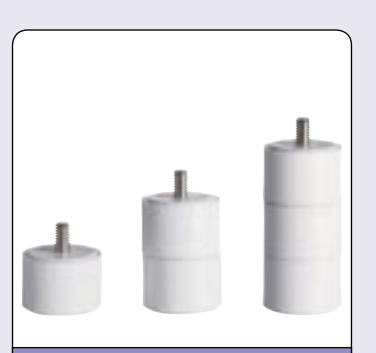
Height adapters with conversation kit for Aquatec® Beluga and Aquatec® Orca Bath Lifts.