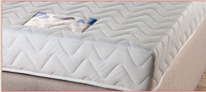
Memory Foam Mattress Code: RMATMF

Pocket sprung mattresses are one of the most comfortable mattresses with an effective design that provides high levels of comfort and support where it's needed most. They are designed to contour with your body and are constructed of numerous individual springs that move independently, giving an exceptional amount of support and cushioning. A pocket sprung mattress uses these individual springs to respond to everyone's individual body weight, increasing their usability and comfort.