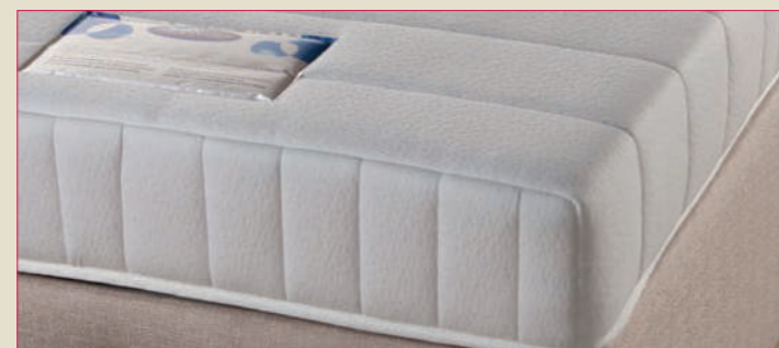
Reflex Foam Mattress Code: RMATRF

Memory foam has a unique open cell structure that reacts and responds to body heat and weight by moulding to the contours of your body, therefore optimising the support it provides. It is the most effective material for relieving pressure points and used for prevention of pressure sores and has multiple orthopaedic benefits making a huge difference to your quality of sleep. This mattress is made up of 5cm memory foam bonded onto 15cm of reflex foam.