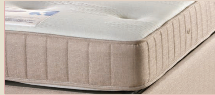
Pocket Memory Foam Mattress Code: RMATPM

Memory foam has a unique open cell structure that reacts and responds to body heat and weight by moulding to the contours of your body, therefore optimising the support it provides. It is the most effective material for relieving pressure points and used for prevention of pressure sores and has multiple orthopaedic benefits making a huge difference to your quality of sleep. This mattress is made up of 7cm of memory foam bonded onto 15cm of reflex foam.