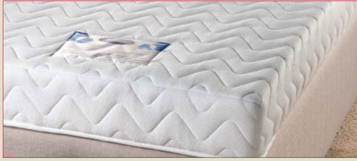
Latex Mattress Code: RMATLTX30

Latex foam mattresses are a recent innovation to the market and are starting to become more popular because of their quality and great levels of comfort. Excellent heat reduction and breathable properties, which are more efficient than any other type of foam, allowing the mattress to breathe and keep fresh. Hypo allergenic and anti microbial, the material which prevents dust, mould and bacteria from settling in the mattress.