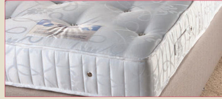
Pocket Sprung Mattress Code: RMATPS

Latex foam mattresses are a recent innovation to the market and are starting to become more popular because of their quality and great levels of comfort. Excellent heat reduction and breathable properties, which are more efficient than any other type of foam, allowing the mattress to breathe and keep fresh. Hypo allergenic and anti microbial, the material which prevents dust, mould and bacteria from settling in the mattress.