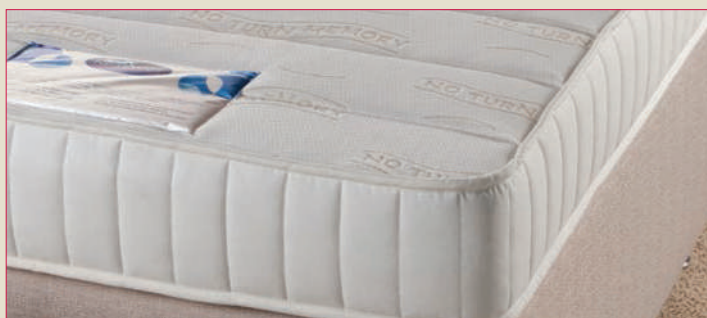
No Turn Memory Foam Mattress Code: RMATMF30-2

The pocket sprung part of the mattress is made with superior quality springs providing the familiar bounce of a traditional mattress. A 7cm layer of high density memory foam is added to provide excellent comfort and support, moulding to your body for a comfortable night's sleep. Owing to the Thermal properties associated with memory foam this provides a warmer option during the winter months. Alternatively you can turn the mattress and sleep comfortably on the cooler side of the 500 pocket spring system, thus providing a firmer support where needed. Available in beige or grey.