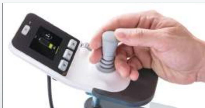
Informative colour display and user-friendly control elements