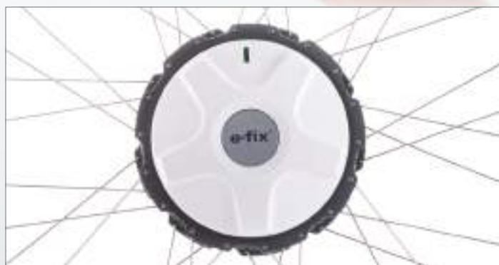
Compact, light, powerful: the e-fix drive unit