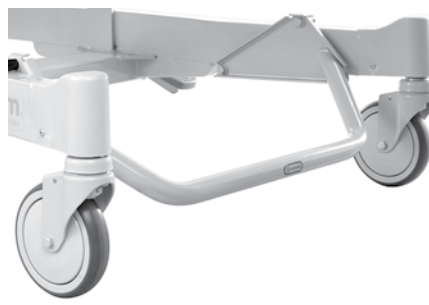
Foot Rest Bar (lift off only) P451A