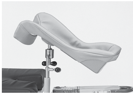
Telescoping Leg Supports P7634C