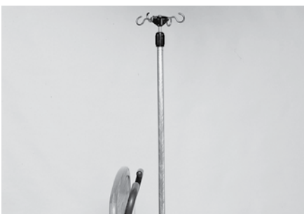
ISS Transfer Pole P158A