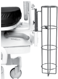
O 2 Tank Holder P27601