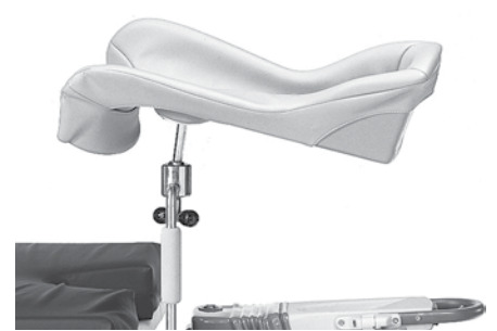
Leg Supports P7625C