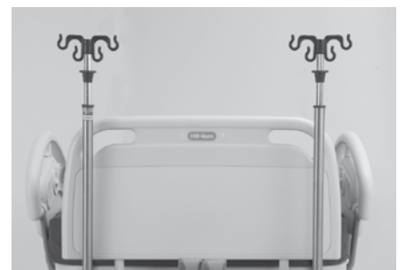
2 permanent IV poles (foldable) P3732A