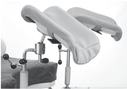
Telescoping Calf Supports P35745A