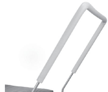
Labour Bar P3613B