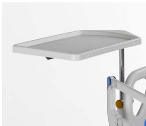
Syringe Driver Tray AC963A