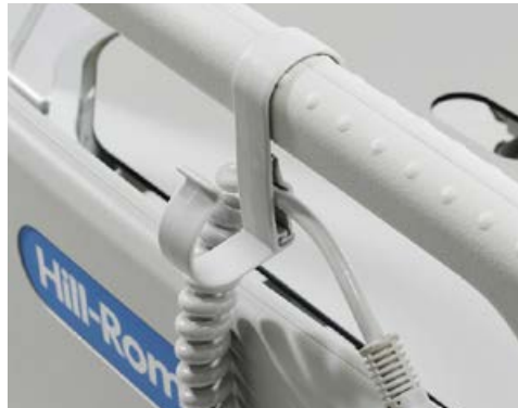
Electric cord holder AD292A