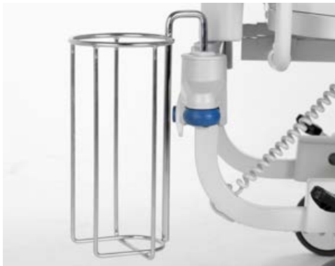
Pivoting Bottle Holder 3L AC962A