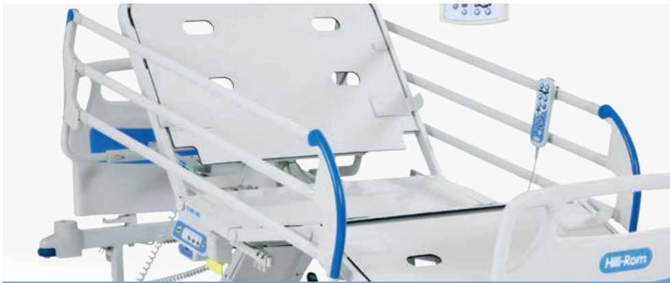
Fold-away siderails AD271B