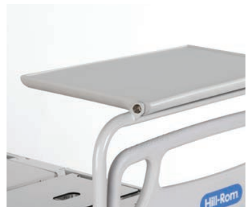
Monitor tray A Version .....AD244A B Version .....AD244B