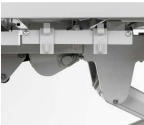
Urine Bag Holder Epoxy Grey A Version only .....AD243A-MM