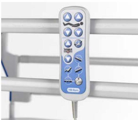
Hand pendant AD281B