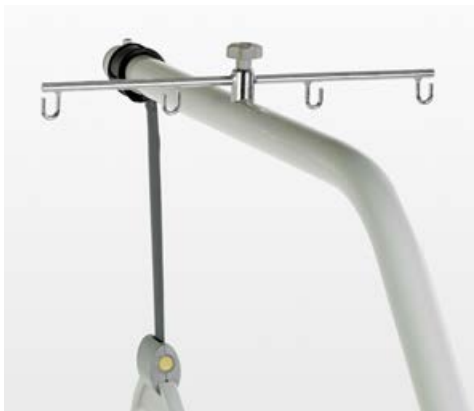
IV hooks on patient helper AC953A