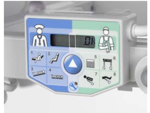
Care Monitor AD291A