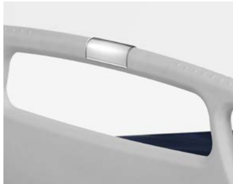
Support name AD325A