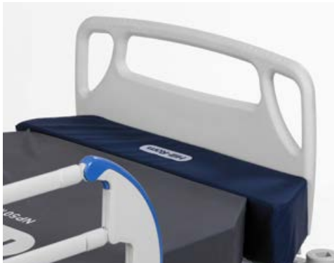
Foam Extension Cushion with Welded Cover 85 x 20 x 21 cm (ASS078) .....AD231A-07