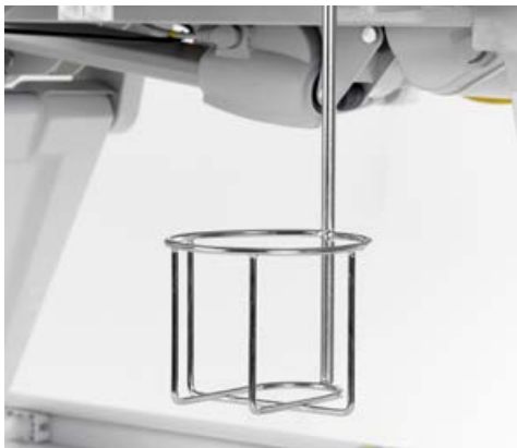
Bottle holder 2L AC938A