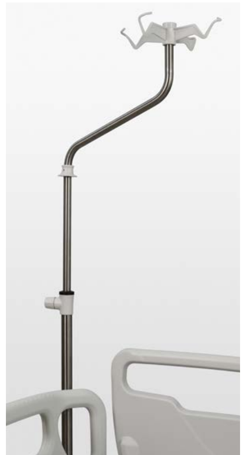
One hand adjustable IV pole, 4 hooks....AD299A Adjustable IV pole, 4 hooks .....AD298A Straight Fixed Height IV pole, 4 hooks... AD294A