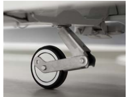
5th wheel Integral ..... AD276A R0 Simple Band ..... AD276A R1 Double Band ..... AD276A R2