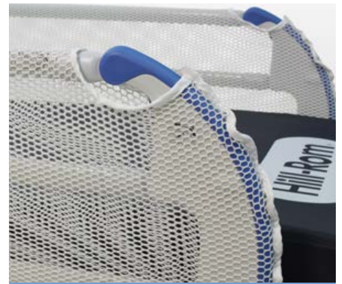
Safety Nets AD312A