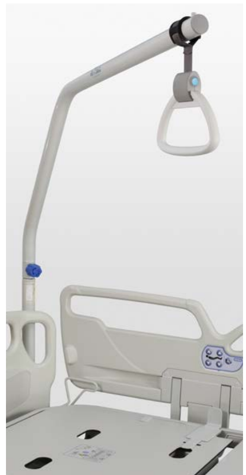
Angle Pivoting Lifting Pole .....AD811A Fixed lifting pole .....AD810A