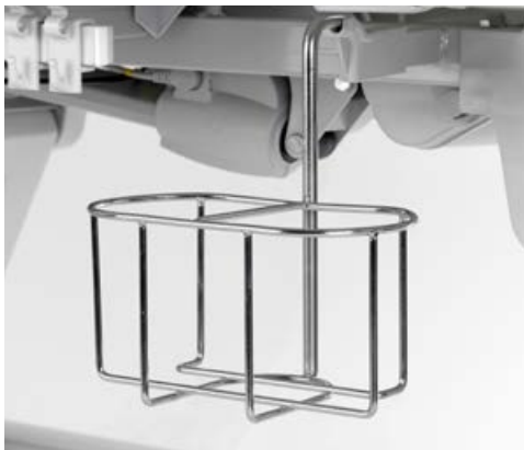
Double bottle holder AC908A