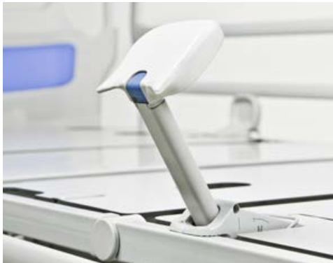
2 Egress Handles For B version bed only at head end .....AD296B For B version bed only at foot end .....AD290B For A version bed only .....AD290A