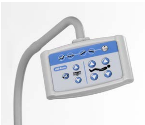
Control on flexible arm AD280A