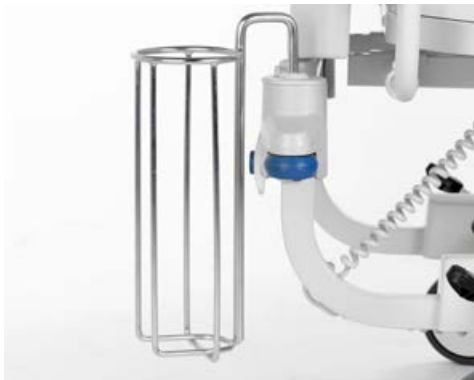
Oxygen Tank Holder 110mm (Size E).....AD102A 110mm (Size D) .....AD101A 150mm ..... AC959A