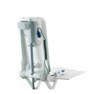
Easy to clean

A cost effective and easy to fit option (available in 70 mm and 120 mm diameter in blue colour only).