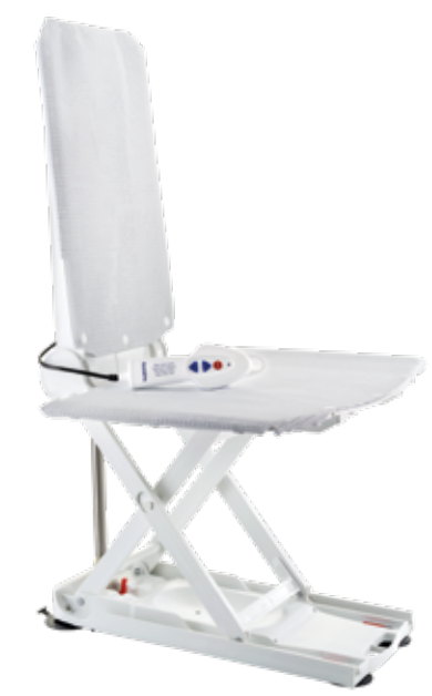
Aquatec Orca<sup>NG</sup> F

An upright bath lift with a fixed backrest, that offers support for those who prefer to bathe upright. The integrated head support of the high backrest ensures a safe and relaxing bath.