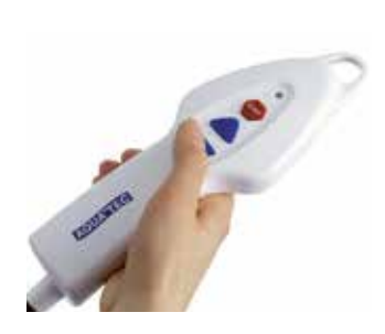
Compact hand control with integral battery

Orca<sup>NG</sup> bath lifts incorporate a revolutionary lightweight battery contained within the ergonomic hand control. Raised profile, coloured buttons and an emergency stop feature allow simple, controlled operation even to those with dexterity issues.