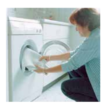
Non-slip cover mats

A sturdy canvas bag with wheels for discreet transport and safe storage.