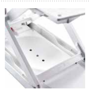
Holes in base plate