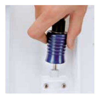
Safe hand control fitting

Orca<sup>NG</sup> bath lifts incorporate a revolutionary lightweight battery contained within the ergonomic hand control. Raised profile, coloured buttons and an emergency stop feature allow simple, controlled operation even to those with dexterity issues.