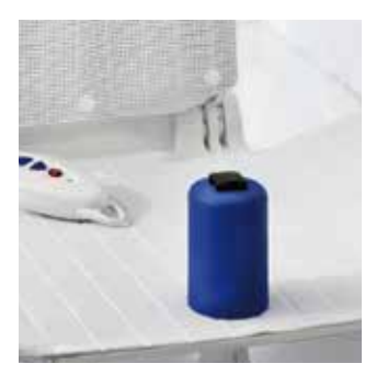
Fast Fit Pommel

A cost effective and easy to fit option (available in 70 mm and 120 mm diameter in blue colour only).