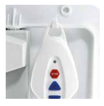
Hand control hook

Carry handle for easy removal from the bath and storage.