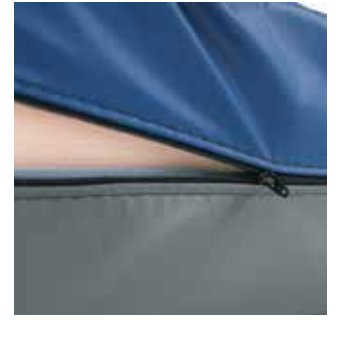
Zip around three sides Allows easy inspection of the foam core.

The cover fabric provides excellent recovery and durability, and helps to reduce shear and friction forces. The base of the mattress is a tough coated polyurethane (PU) which protects the mattress when used with electric profiling bed frames.