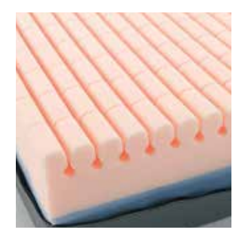
Strong, durable construction The Invacare Softform Excel is an established choice of healthcare professionals.