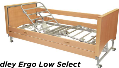
Medley Ergo Low Select

The flexible design of the Medley Ergo Low allows the bed to be mounted at a low height, or a higher position if preferred, creating a range of working heights for the carer and transfer heights for the client. This is facilitated by the unique feature of the bed end, which enables the mattress support to be mounted in both upper and lower positions.