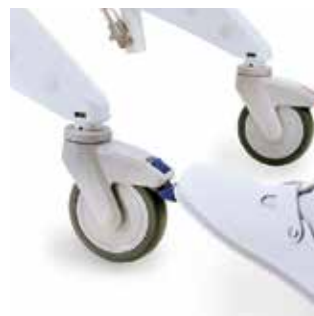
Directional lock Easy to operate brakes on 3 castors, 1 castor with directional lock to help push the chair in a straight line.