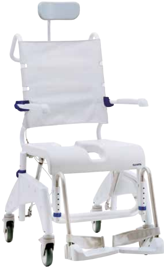
Aquatec Ocean VIP