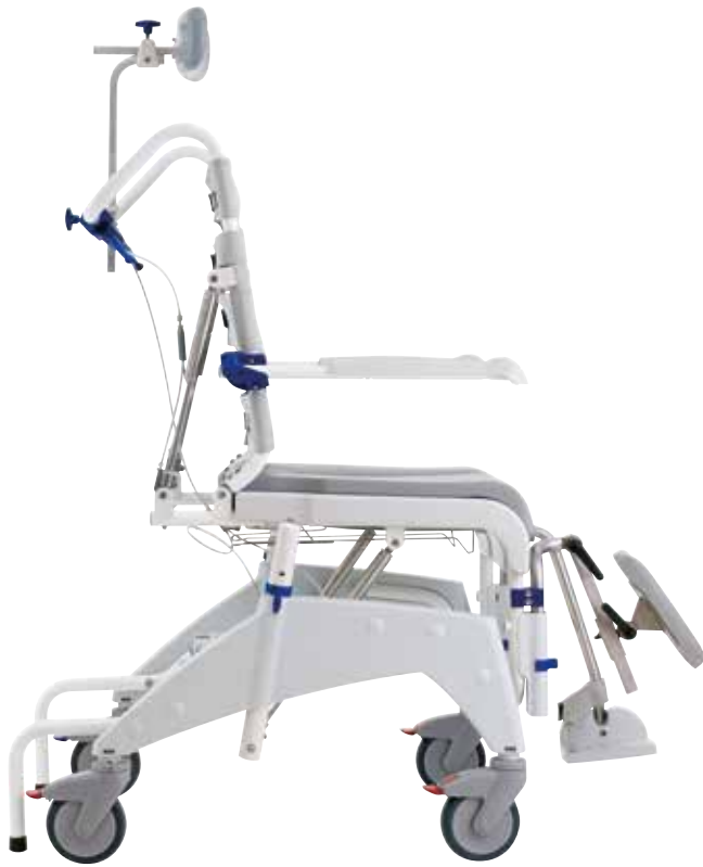
Aquatec Ocean Dual VIP