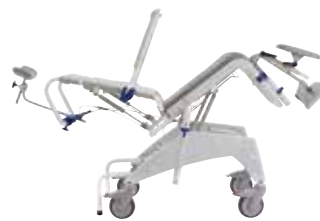
Full seat tilt 35°, backrest recline 50°