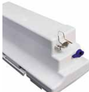
Detachable battery pack