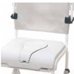
Standard soft seat with key shaped cut out for hygiene access.