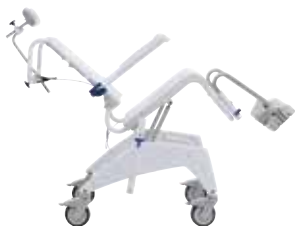
Seat tilt Tilt angle 0° - 35°.