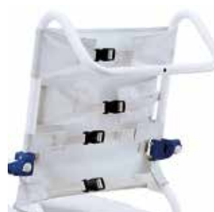
Tension adjustable back can be adjusted to the client.