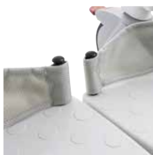
Height and angle adjustable swing away footrests with textured footplates and heel loops.