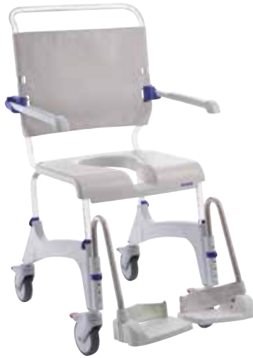
Aquatec Ocean XL