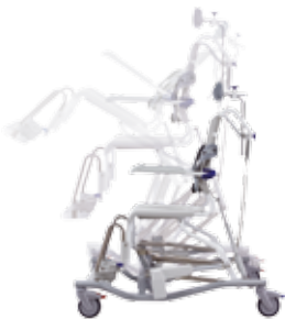
Maximum tilt angle and maximum seat height