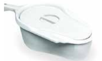
Toilet pan with handle and cover as standard.