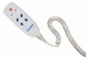
Clearly laid out hand control