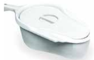
Toilet pan with handle and cover as standard.