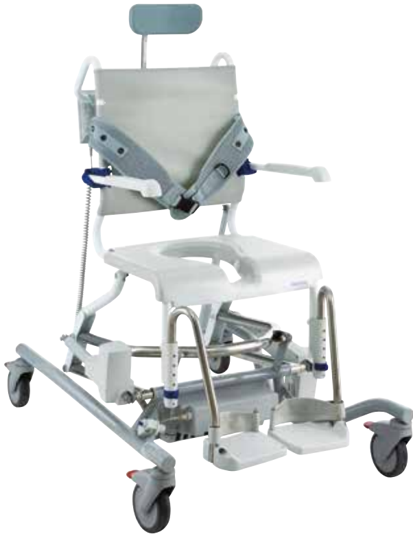
Aquatec Ocean E-Vip