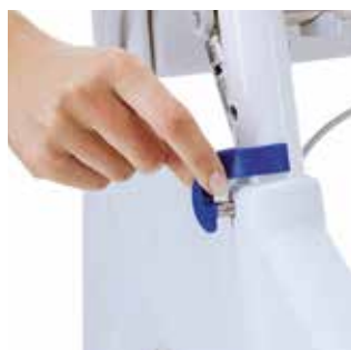
Adjustable seat height Adjustable in 3 steps, no tools required.