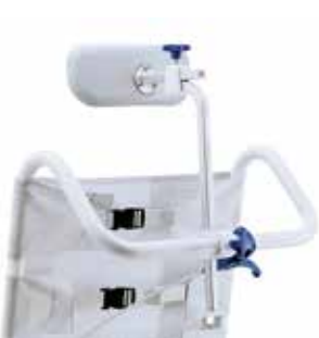
Headrest Height and depth-adjustable headrest included.