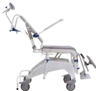
Seat tilt 0°, backrest recline 25°