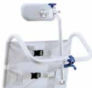
Headrest Height and depth-adjustable headrests included.