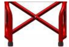
Frame FF 85° (integrated footrest), inset (20 mm on each side), active