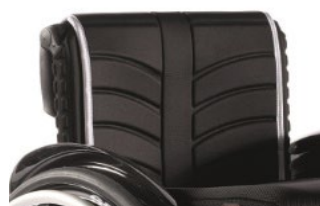
EXO backrest sling