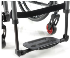
Platform footplate lightweight angle & depth adjustable composite flip up