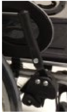
Brake lever extension