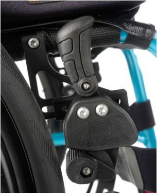
Knee lever wheel lock