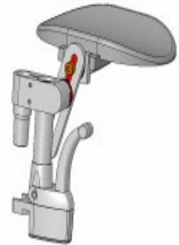
Amputee Support Pad