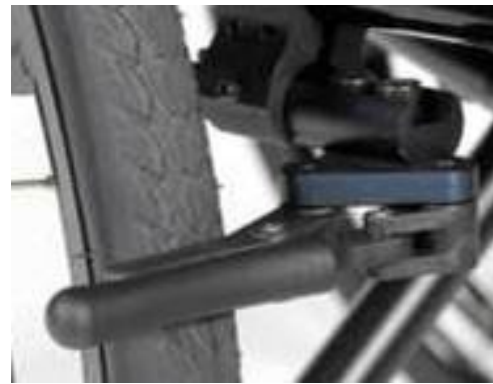
Compact wheel lock