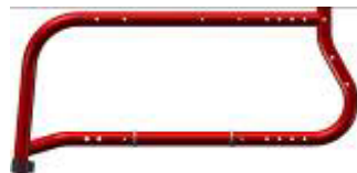
Life FF 85°