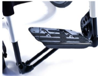
Footboard platform, lightweight, carbon fibre, auto folding