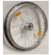
Drum brake wheel