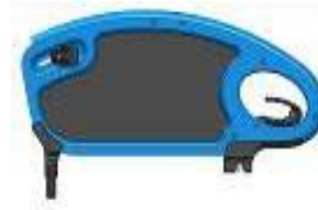
Desk armrest without armpad