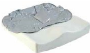
Jay Easy Fluid (picture shown without upholstery)