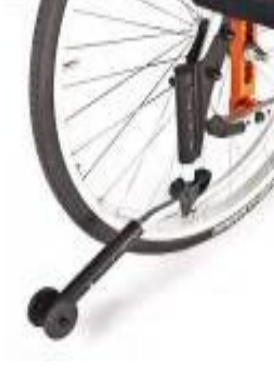
Anti-tip swing away