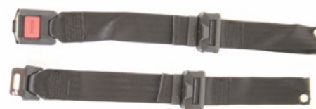
Lap belt with buckle, metal