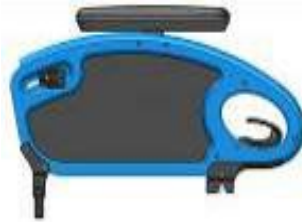
Desk armrest, fixed height, short armpad(25cm)