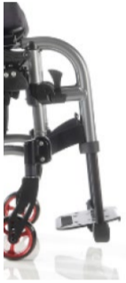
Aluminium hanger, 90°