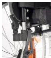
Angle adjustable back -12° to 12°