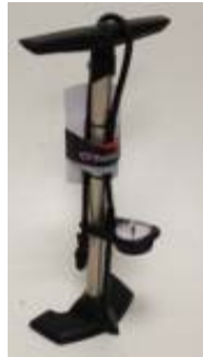
High pressure pump