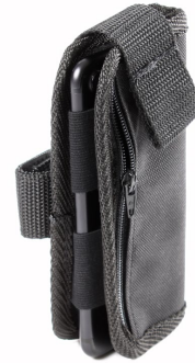
Mobile phone pocket