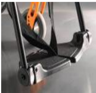
Divided footplate composite