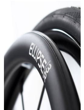
Ellipse 3R Handrim