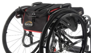
Backrest, fold down (to the front)