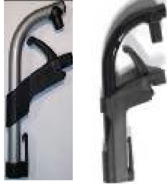
Composite hanger 70°/80°