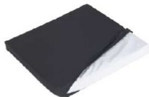
Seat cushion, climate membrane water-resistant, cover with zipper, black