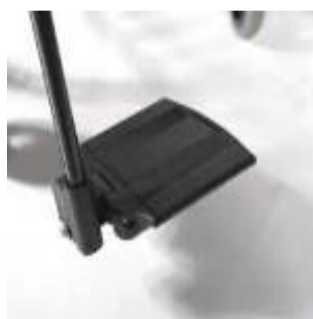
Divided footplate aluminium