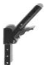
Backrest, Half Folding