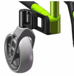
Expansion kit, designed for hemiplegic users