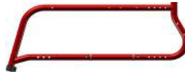
Life FF 75°