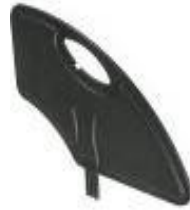
Sideguard composite detachable