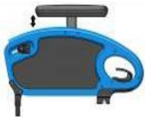
Desk armrest, height adjustable, short armpad(25cm)