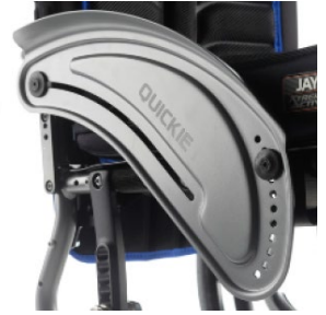
Sideguard alu with fender