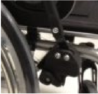
One arm wheel lock