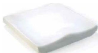
Jay Basic (picture shown without upholstery)