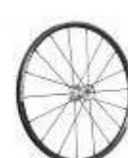
Spinergy wheel, 18 spokes