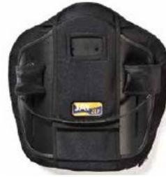
Jay Zip Back