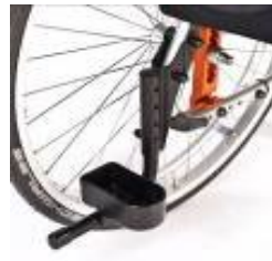
Crutch holder, loop