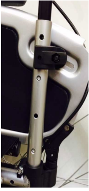
Backrest tube, aluminium