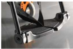
Footboard, divided, composite, angle- adjustable, flip-up (sideways), heel loop, black