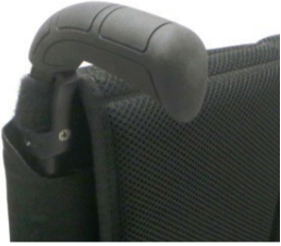
Push handles long