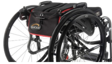
Backrest, fold down (to the front)