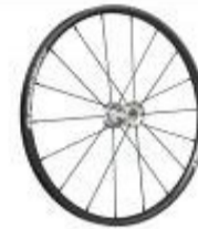
Rear wheel, Spinergy, 18 spokes (black), straight spokes; hub: silver