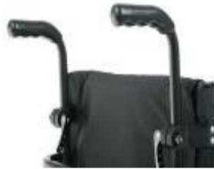
Push handles, height-adjustable