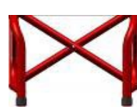
Frame FF 95 ° (integrated footrest), 20 mm inset, active