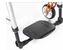
Footboard, platform, lightweight, plastic, angle & depth- adjustable flip up (sideways), calf strap