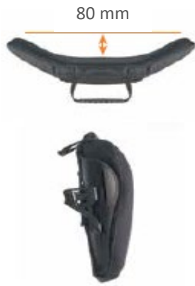
Jay 3 Back Mid Contour