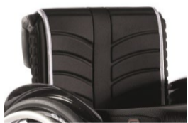
EXO backrest sling