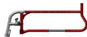
Frame SA (removable footrest)