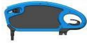
Desk sideguard, flip-up, remove