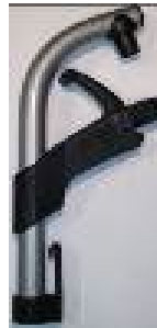
Composite hanger 110°/100°