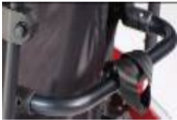
Stabilizer bar, automatic folding