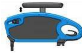
Desk sideguard, armpad, height-adjustable, flip-up, remove