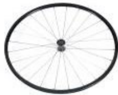
Rear wheel, Lightweight, 24 spokes, straight spokes