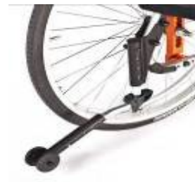
Anti-tip tubes, swing- away, left