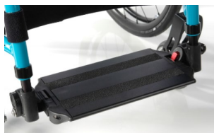
Footboard, angle and depth adjustable; flip up, aluminium with locking system