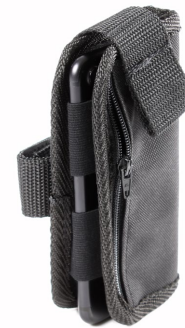
Mobile phone pocket