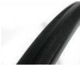
Tyre, puncture proof, tread