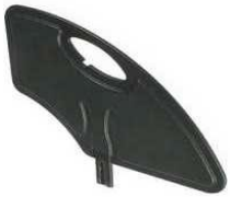
Composite sideguard, removeable (black)