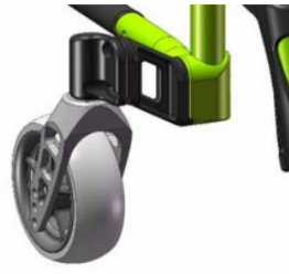
Expansion kit, designed for hemiplegic users