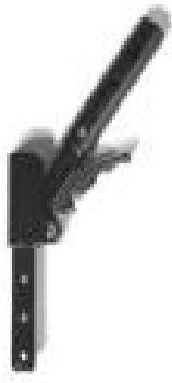
Backrest, half folding (to the back)