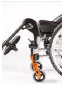
Elevating legrest (ELR)