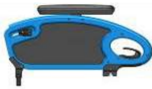
Desk sideguard, armpad, fixed, flip-up, remove