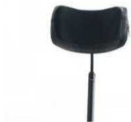
Headrest, height, depth and angle adjustable