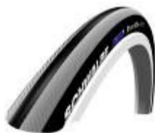
Tyre, pneumatic, fine profile, Schwalbe Right Run