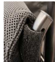
Without push handles,