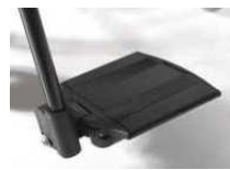
Footboard, divided, aluminium, angle- adjustable, flip-up (sideways), heel loop, black