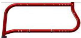
Frame FF 105 ° (integrated footrest)