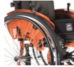
Push to lock brake, integrated in sideguard, Safari