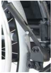
Push to lock brake, one- arm, right actuation