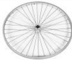
Rear wheel, Design, 36 spokes, straight spokes