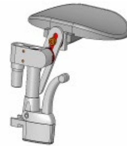
Amputee Support Pad