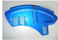
Aluminium sideguard, fender, wet weatherprotection (in frame colour)