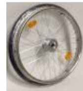
Rear wheel, drum brakes, 36 spokes, cross- wise spokes