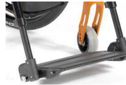
Footboard, platform, lightweight, plastic, angle & depth-adjustable flip up (sideways), calf strap, black