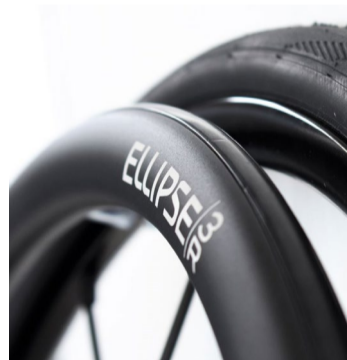
Ellipse 3R Handrim