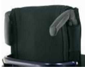
Push handles, fold-down