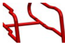
Frame FF 105° (integrated footrest), abducted (20 mm on each side)