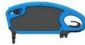
Desk armrest without armpad