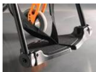
Divided footplate composite