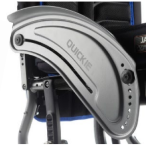
Sideguard alu with fender