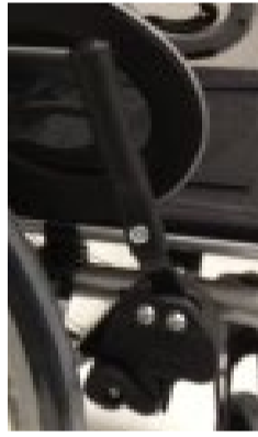
Brake lever extension