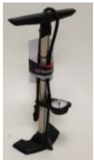
High pressure pump