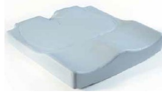
Jay Easy Visco (picture shown without upholstery)