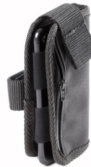
Mobile phone pocket