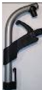
Hanger Angle 70°/80°