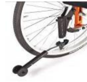
Anti-tip swing away