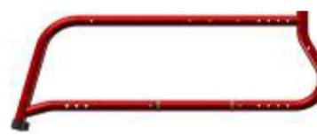
Life FF 75°