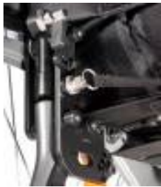
Backrest, angle-adjustable, lock when folded