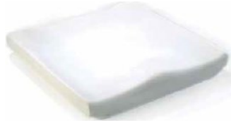
Jay Basic (picture shown without upholstery)