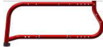
Life FF 85°