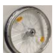
Drum brake wheel