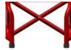
Frame FF 85° (integrated footrest), inset (20 mm on)