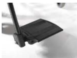
Divided footplate aluminium