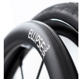
Ellipse 3R Handrim