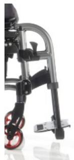
Aluminium hanger, 90°