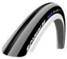
Right Run Tyre