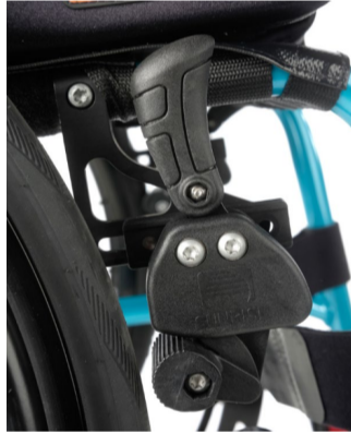
Knee lever wheel lock