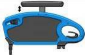
Desk armrest, height adjustable, short armpad(25cm)