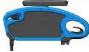
Desk armrest, fixed height, short armpad(25cm)