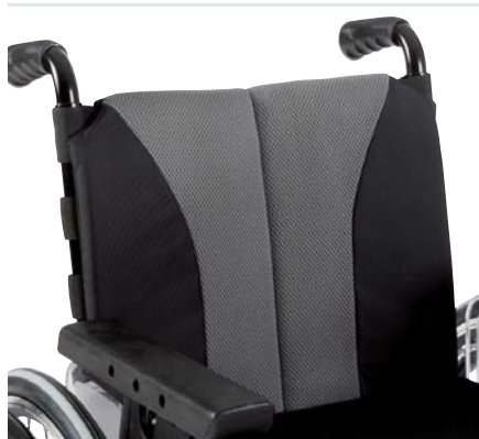
• Silver grey/black