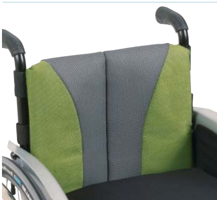
• Silver grey/green