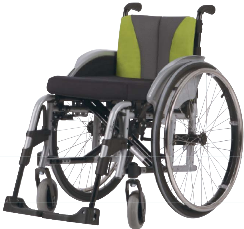
• Motus CV

Both models are individually configurable and can be equipped with a wide variety of options in order to offer the greatest possible benefit according to the needs of each user. Thanks to proven, reliable technology, these all-rounders are straightforward and fast to configure.