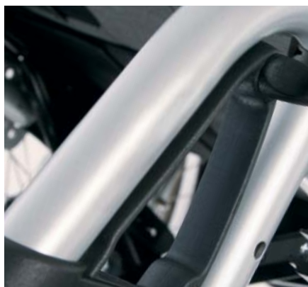
• Silver metallic