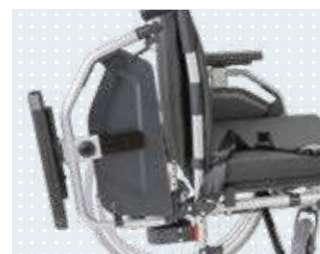
• Swing-away side panel