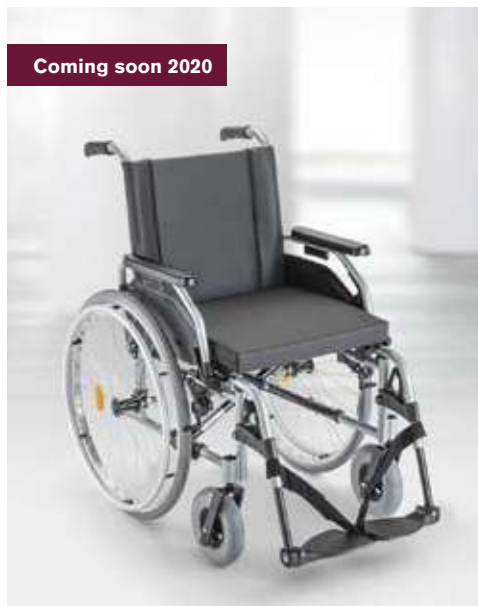
• Start M1 – The entry-level stock versions Lightweight segment Available in five versions