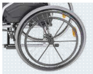
• One-arm drive