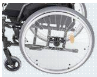
• Spoke protector