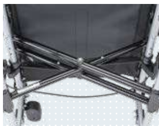
• 1.5-fold crossbrace