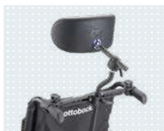
• Head supports