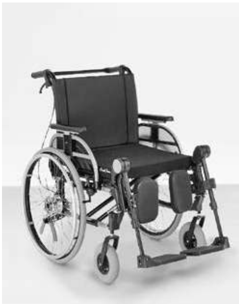
► Start M4 XXL – The model for special sizes Lightweight segment