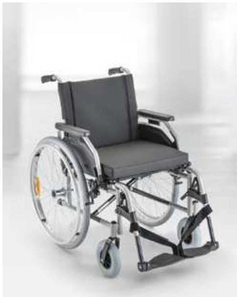
• Start B2 – The entry-level model Standard segment