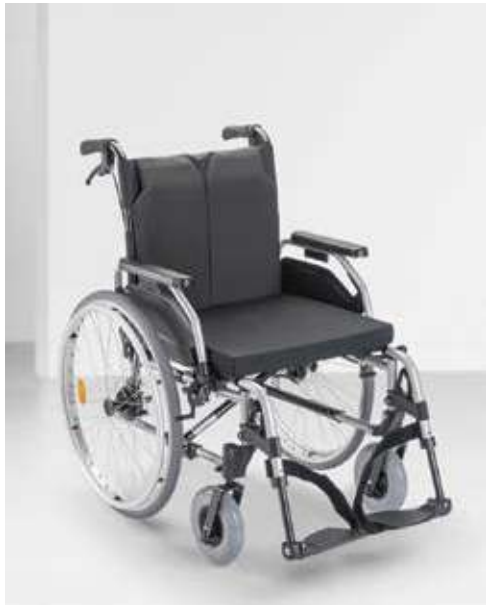
► Start M2 – The configurable model Lightweight segment