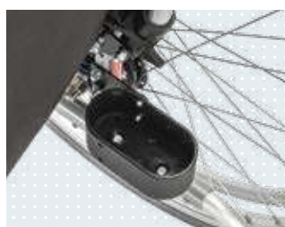
• Crutch holder