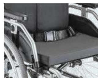
• Lap belt with closure