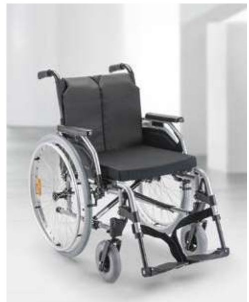
• Start M2S – The preconfigured stock versions Lightweight segment Available in the following versions: TB, Hemi, Flex, Flex Strong or Flex Prop