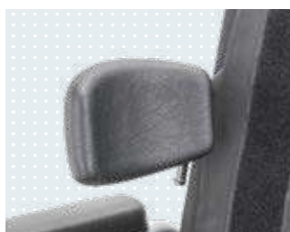
• Lateral thoracic support