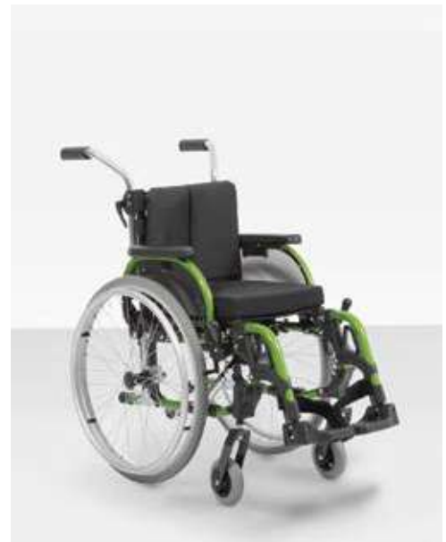
► Start M6 Junior – The model for kids Lightweight segment