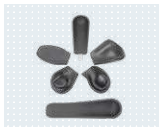
• Arm and hand support