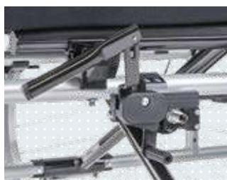
• Wheel lock lever extension