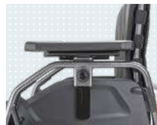
• Height-adjustable forearm support