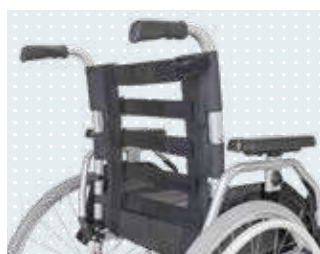
• Economy Ergo back support upholstery