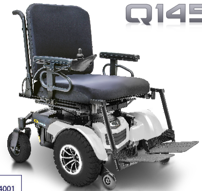
Q1450 with Synergy® Seating