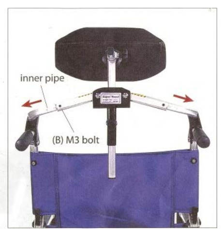
Have a person help by slightly pushing rear handles of wheelchair apart, simultaneously adjust center joints as high as possible (in order to obtain adequate support tension for headrest) then tighten bolts (B)