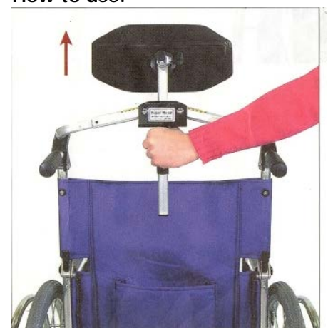
When using wheelchair, unfold wheelchair first, then prop up the headrest.