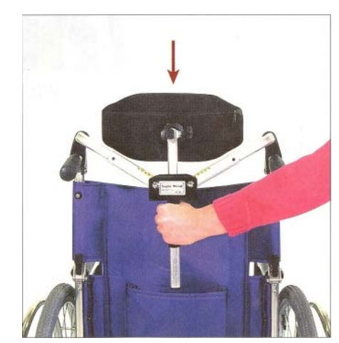
Conversely when folding wheelchair, first pull down the headrest to release the support tension, then fold wheelchair.