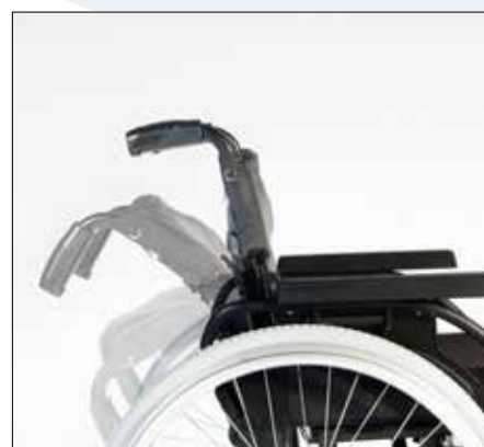
Half folding back