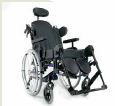
Comfort seat and reclining back (option) for increased sitting tolerance.