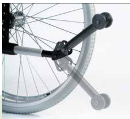
Anti-tips (swing-away, adjustable)