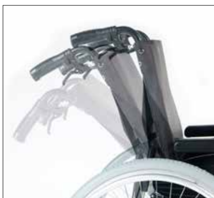
Reclining back (30° infinite adjustable)