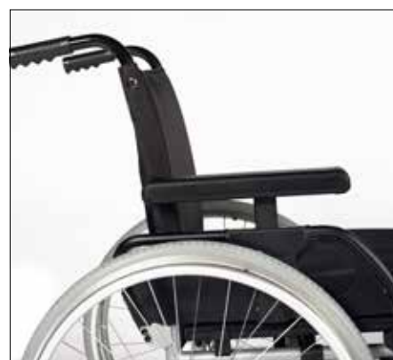
Height adjustable armrest with sliding pad for long and short position