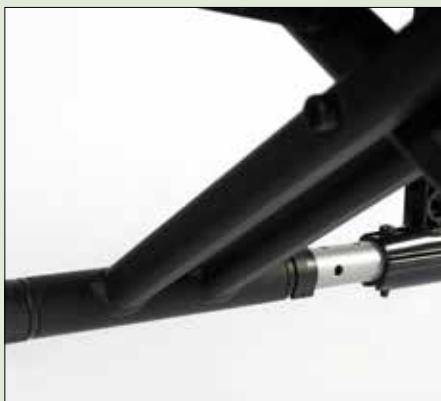
New robust three arm cross brace.