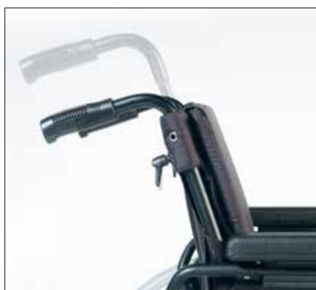
Height adjustable push handles

The X Family 2 comes with a wide range of options, settings and adjustments.