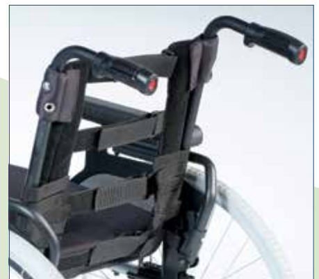
Tension adjustable four strap backrest extendable from 41 - 46cm.