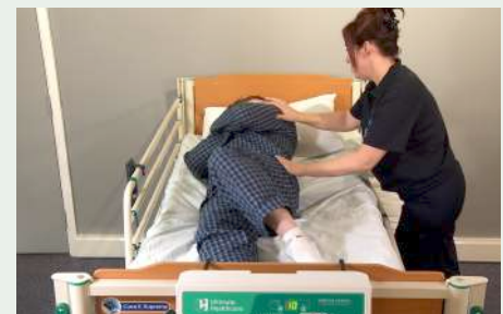
Single handed care can be easily achieved using the turn assist. The amount of effort needed to manually turn a patient is significantly reduced, taking away the need for a second carer.