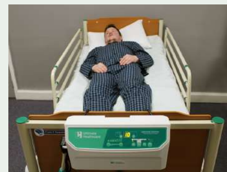
Continuous automatic turning can reduce the need for care, where a patient needs to be turned on a regular basis.