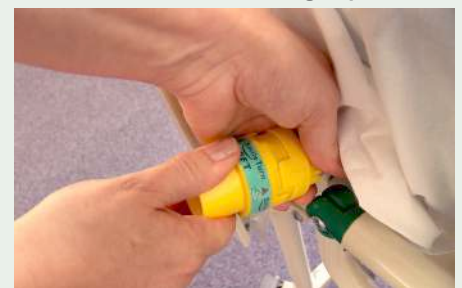
Activation of the turning valve fitted to each side of the mattress allows for both assisted turning when required or automatic unassisted continuous turning reducing care support.