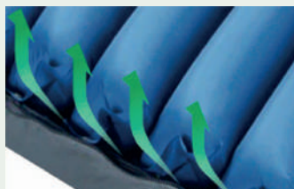
Low air loss "LAL" reduces skin heat and moisture by utilising the alternating air after each cycle releasing up to 100 litres of air underneath the cover to ventilate and cool the skin for climate control.