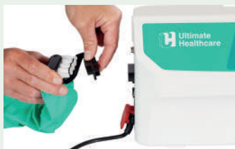
Simple pump connector including transport mode.