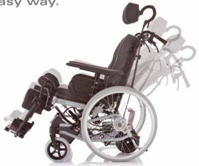
viaplus with differing backrest inclinations

viaplus is also used in residential homes. With it, pushing the wheelchairs becomes an effortless task and lightens the load for the staff.