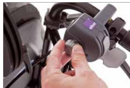
On/Off and speed adjustment

The wheelchair's functions are all clearly marked on a handy, non-slip grip control knob that can be operated with just one hand – for easiest possible use from the word go. The rechargeable battery of the viaplus is mounted inconspicuously below the seat of the wheelchair and is powerful enough for even long walks. It can be quickly and easily recharged using the battery charger supplied with it.