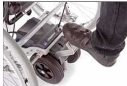
Disengaging the drive unit

The handy controls of the viaplus fit onto the handle of the wheelchair without impeding the use of the wheelchair's functions. The wheelchair is propelled forwards by light thumb pressure on the operating lever, making fatigue-free operation possible even on longer journeys. The chair is put into reverse by pulling the operating lever upwards. And for indoor manoeuvring without the aid of the viaplus, the drive wheels can simply be raised by pushing down on the pedal.