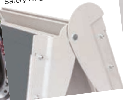
Underside of ramp: halves lock together when in position