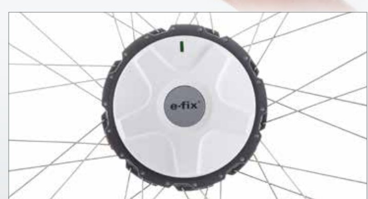
Compact, light, powerful: the e-fix drive unit