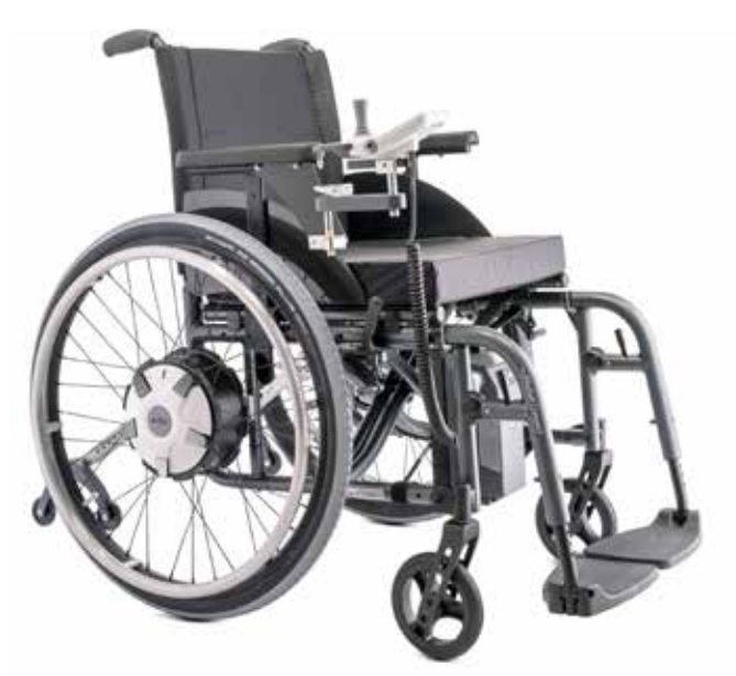
e-fix E36: powerful drive wheels with more power (optional)