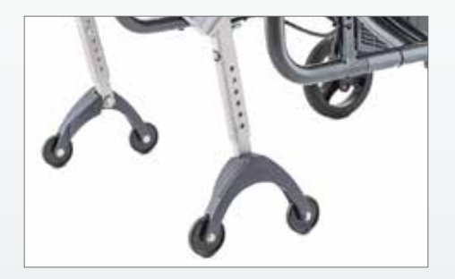
Anti-tippers with jack-up function: This makes it even easier to remove the e-fix wheels.

and much more... Alber or your local dealer would be glad to give you detailed information on the wide range of accessories.