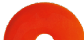
Pure metal bronze