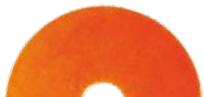
Sparkle light orange