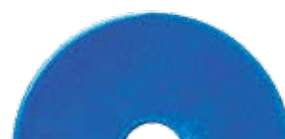
Dormant marine blue