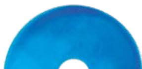
Dormant sky blue