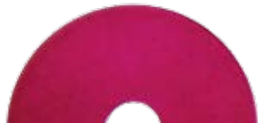
Snake clear red