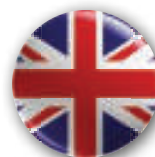
Designed, Manufactured & Stocked in the UK