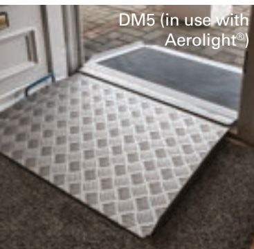
DM5 (in use with Aerolight®)