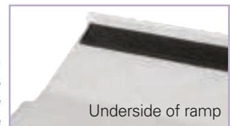
Underside of ramp

Unique lip design with rubber anti-slip secures on threshold while protecting door frame