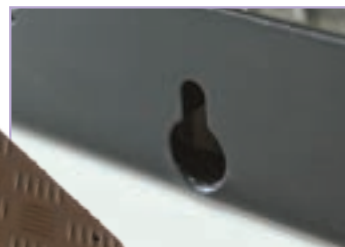
Easily fixed in place