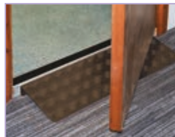
No protruding legs to obstruct door swing