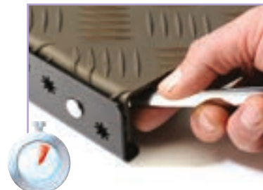
Assemble or adjust for re-use in less than a minute!