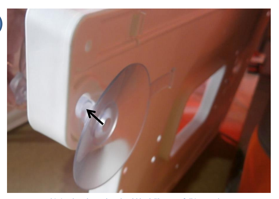
This is what the sucker should look like once full inserted. You will the need to move it up to the top half.