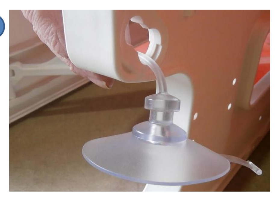
Thread through the sucker into the bottom half of the hole.