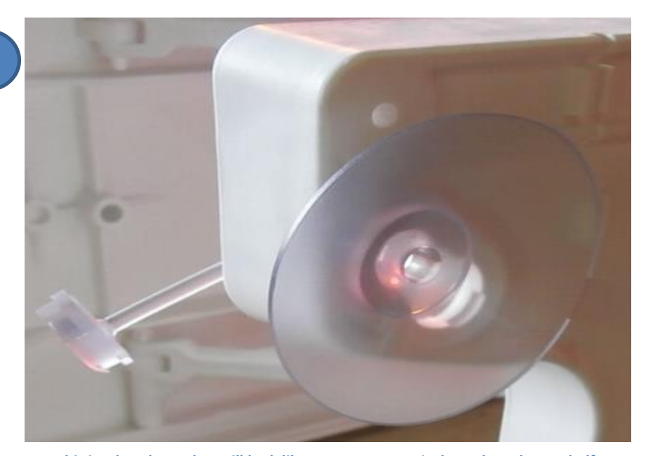
This is what the sucker will look like once you move it through to the top half.