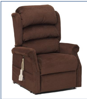
Washington Chair (up to 2014)

*** Products and parts may no longer be supported ***