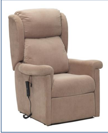
For Seattle (ILR4) and Dakota (ILR12) Intalift Chairs (Upto 2018) 2014 – 2018

*** Products and parts may no longer be supported ***