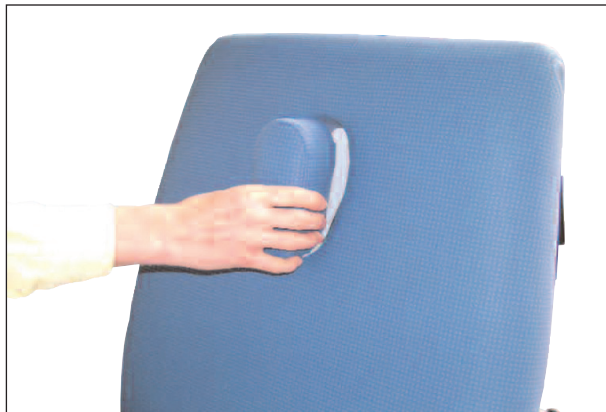
Fig 7: Breathing hole

The Plinth has an integral breathing hole. To use the breathing hole the bung must be removed, as shown in figure 7.