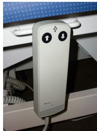
Fig 4: Handset holder

The Plinth has an integral handset holder on both sides of the seat section so that the handset can be stored when not in use (as seen in Fig 4).