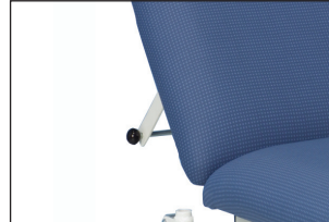
Fig 3: Paper roll holder

5. Situated on the backrest is a paper roll holder (paper roll not supplied with couch). To install a roll, twist anti-clockwise one black ball end fitting off the rod and slide the rod out of its hanger. Position the paper roll between the hanger and reposition the rod and ball end fitting.