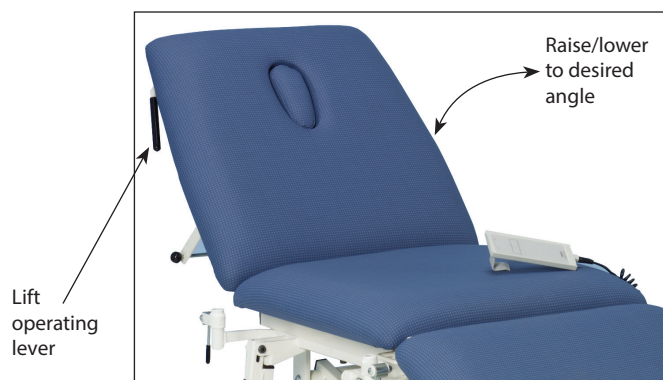
Fig 5: Adjusting the backrest