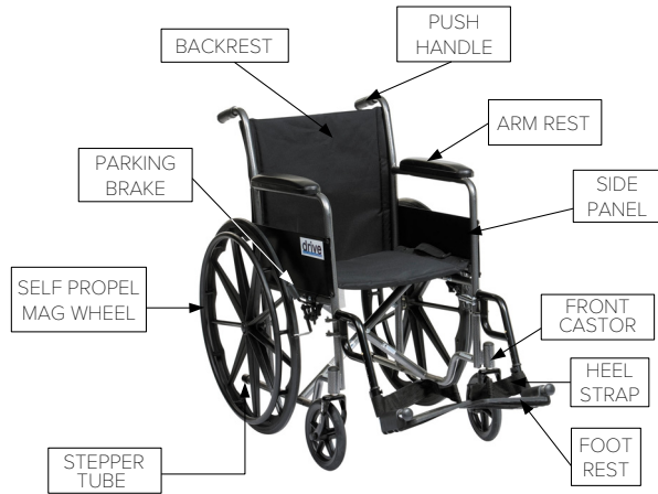
Silver Sport Wheelchair (SSP118FA-SF)