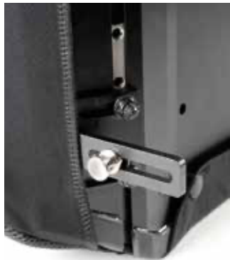
// ATTACHMENT BRACKETS