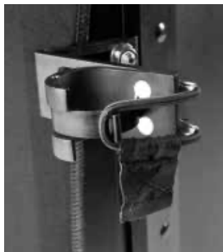
// SNAPTITE HARDWARE