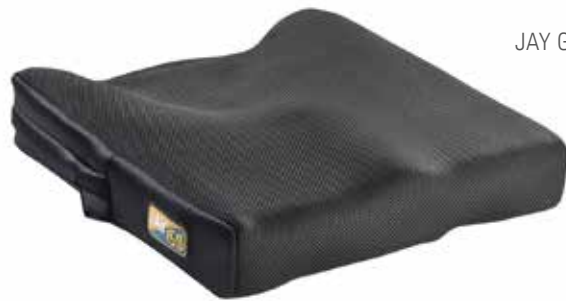
JAY GS cushion

The combination of the JAY Fit Back and the JAY GS Cushion is a perfect seating combination for children and young adults. These two JAY products together are a great option for paediatric clients who require a more lightweight, supportive, adaptable seat system on either a manual, tilt-in-space or powered mobility base.