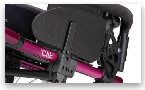
The replaceable cross tube with TAPER LOK increases Clik's rigidity resulting in an easier to push chair. Optional integrated receivers use less space so you can get everything in the right spot. The first time.