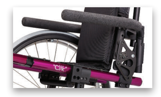
Clik's unique swing away armrest allows for independent angle adjustability, while integrated into the backrest for easy growth. Your arm is always where you need it.

Whether setup in mid-wheel for the smallest riders or to help promote and teach the balance and wheeling skills that encourage confidence to overcome everyday obstacles and terrain. Be Dynamic.