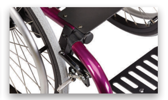
Compound offset frames ensure your kid has the fit they need. More room for abducted positioning, AFO's and braces.