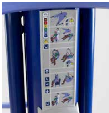
User instructions summary panel - always there when you need it.