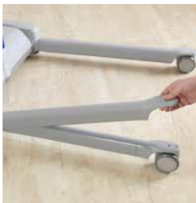
Removable chassis leg covers are easy to detach for cleaning.