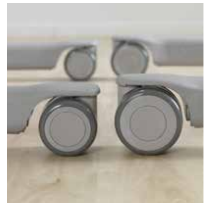
Low height castors - for easier bedside access.