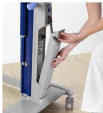
Changing the battery is easy.