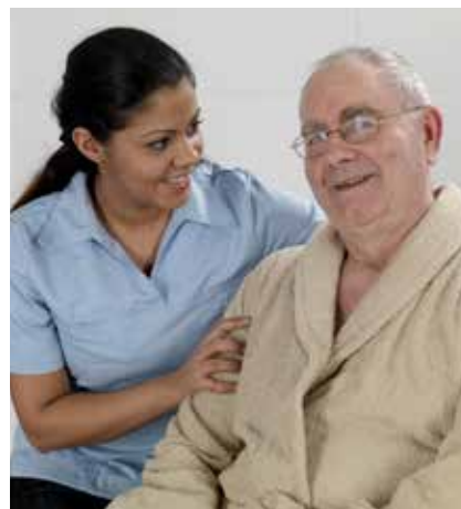
Total solutions with people in mind.