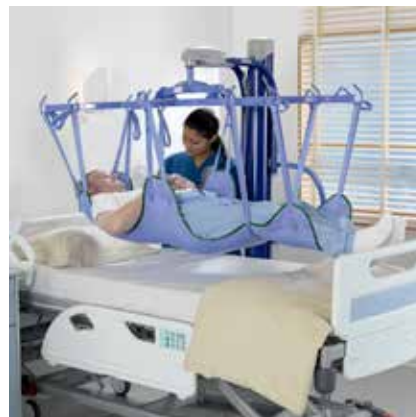
An optimum solution for supine lifting of patients in acute care...