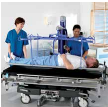
...or lift supine patients on stretchers.

Good stability is fundamental for safe operation of the lifter and the patient's sense of security during transfers. Maxi Move is based on a lifting principle that assures excellent stability.