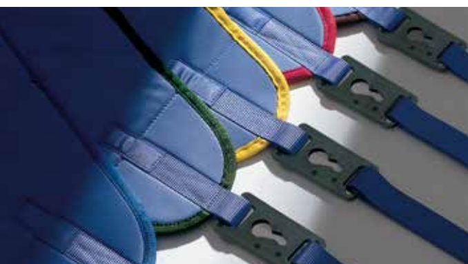
Slings for individual needs.