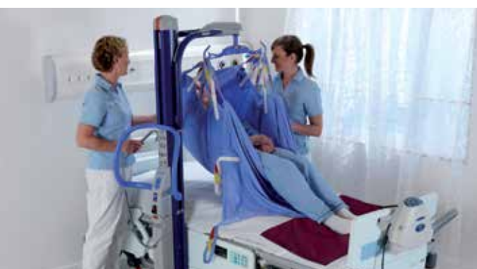
Allows easy repositioning up in bed with stretcher sling.

The Combi attachment is a safe, easy-to-use locking device for all ArjoHuntleigh passive lifters that allows easy interchanging between the market's widest selection of spreader bars and stretchers.