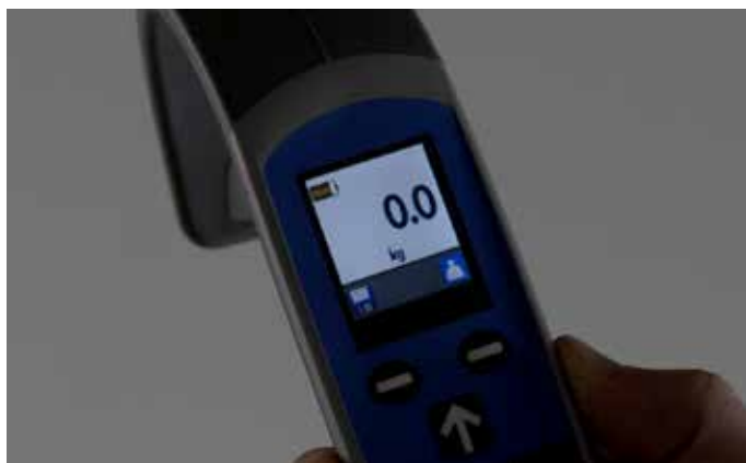
TROL Screen with illuminated display.

The handset is made out of extremely durable material with an integrated hook which allows it to be placed conveniently on lift.