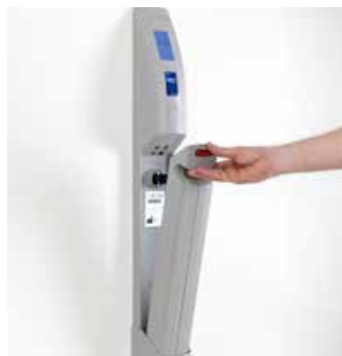
The convenient wall mounted battery charger.