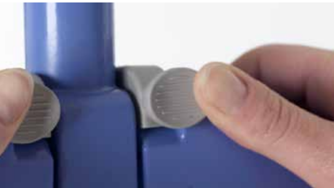
Combi attachment for maximum flexibility.