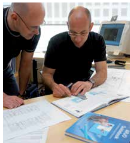
Facility planning advice for architects.