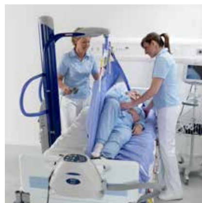
...or for repositioning and turning patients in bed.