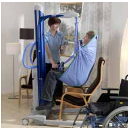
...transfer patients to chairs...