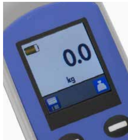
The battery power level is clearly displayed.

This proven and thoroughly tested lifter is built to last and will perform safely and reliably, providing continuous optimum performance throughout a long service life.