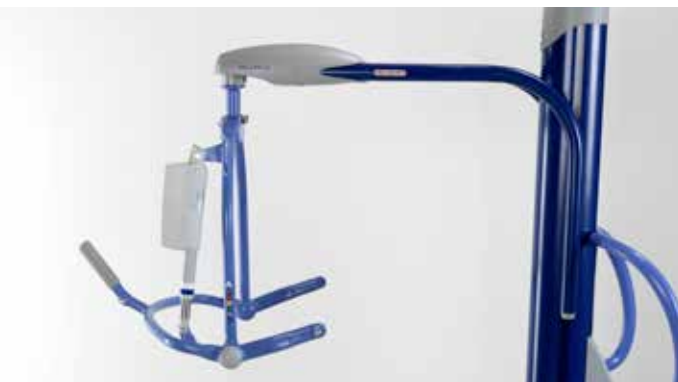
Extended jib for extra reach.