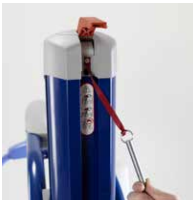
The emergency lowering system allows the patient to be lowered without the use of tools.