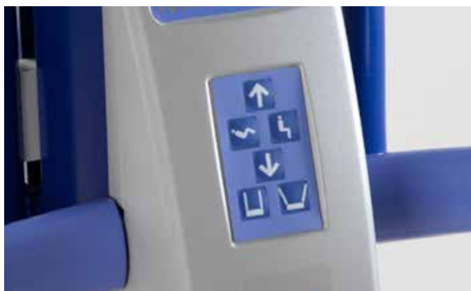
Dual control function - operate Maxi Move from the mast control panel or the handset.