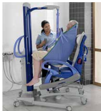
Maxi Move integrates well with the Carendo.