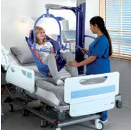
A safe and easy way to position patients in bed...