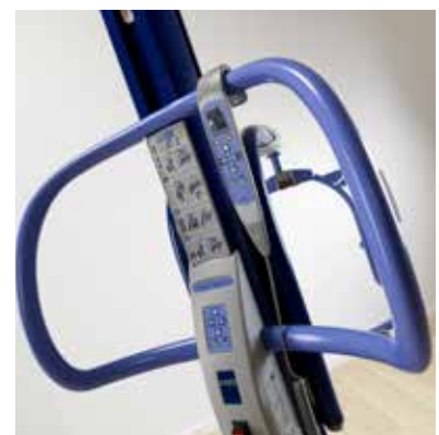
Ergonomic handles assists in smooth manoeuvring.