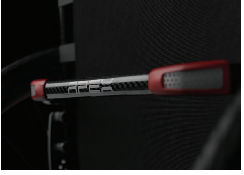
With the Motion Composites APEX chair, I feel lighter than ever.