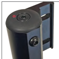
6 ANTI-FLUTTER SYSTEM Provides a smooth, more efficient ride