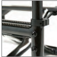
2 REINFORCED BACK CANE SUPPORT For added stability and comfort