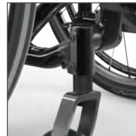
7 INTEGRATED CASTER HOUSING Offers simple and infinite angle adjustments