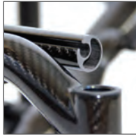
1 CARBON SEAT RAIL Fully molded with integrated seat slider for better seat sling support