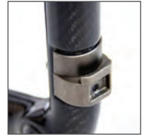
4 FOOTREST ANCHOR Bracket is inset with an integrated friction plate to protect the carbon fiber