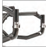
3 HYBRID FRAME DESIGN Eliminates the need for both hemi and standard frame, while providing a complete range of seat-to-floor heights