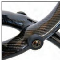
5 ULTRARIGID FOLDING SYSTEM Offers best-in-class propulsion efficiency