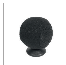
EU082 Soft ball, black cover