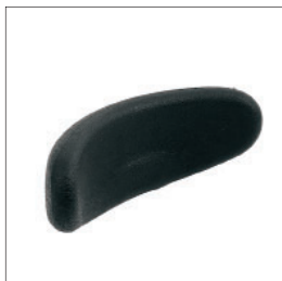
EL006/EL007 Head support small/large