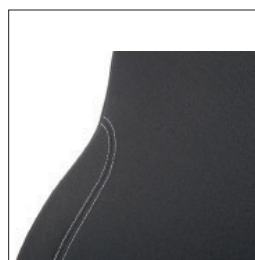
EC022 Fabric cover