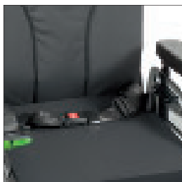
EP001 Standard lap belt