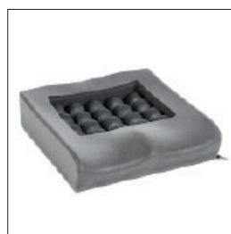
EC016 Terra Flair