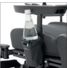
ES010 Beverage holder