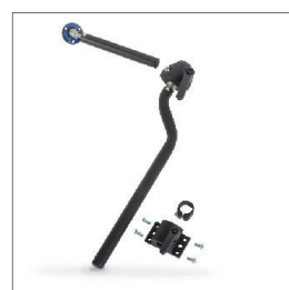
EL002 Multi-axis, offset