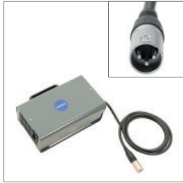
EU041 Battery charger 8 A, fanless