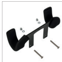
ES005 Crutch holder