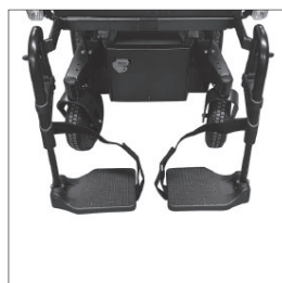
EB011 Standard (basic design)