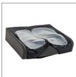
EC015 Terra Aquos