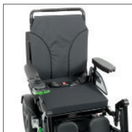
EC001 - EC004 Standard seat