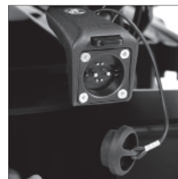
EU043 External magnetic charging receptacle