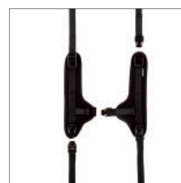
EP014 - EP016 Shoulder harness S/M/L