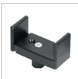
EU080 Fork for tetraplegics, horizontal