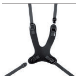
EP005 - EP007 Dynamic harness S/M/L