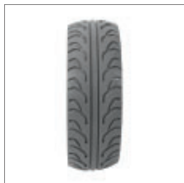
EG015 Caster wheel with ribs