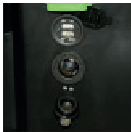
ET002 Receptacle f. 12 V ET003 Receptacle f. 24 V ET004 USB