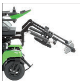
EB004 Power elevating, simultaneous control