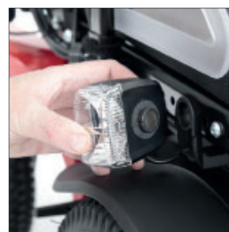
ES021 Electric lighting