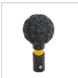
EU084 Ball top, large