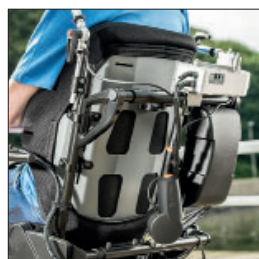
ED036 Baxx aluminium flat top back support