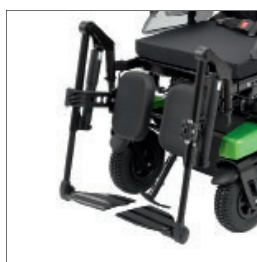
EB007 Individual aluminum foot plates