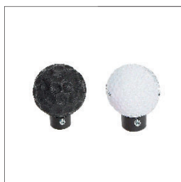
EU083 Ball top, small