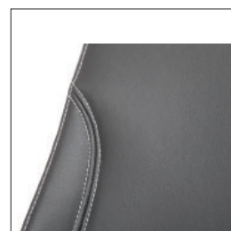
EC023 Synthetic leather cover