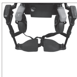
EB001 Standard (new design)