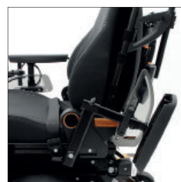
EE024 Flip-up arm supports