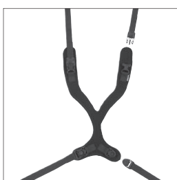
EP011 - EP013 Slimline sternum harness S/M/L