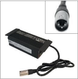
EU045 Battery charger 5 A, with fan