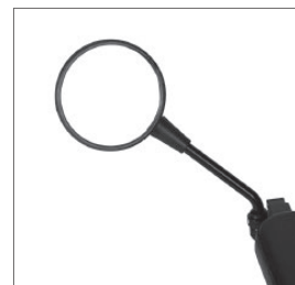
ES006 Rearview mirror