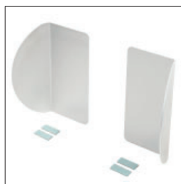
ED039 Side panels