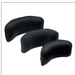
EL033/EL034/EL035 Comfort Plus