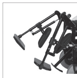
EB002 Mechanically elevating with length adjustment