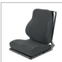
EC021/ED035 Deep contoured