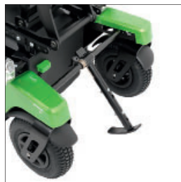
EF021 Curb climbing assist