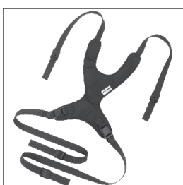
EP008 - EP010 Sternum harness S/M/L