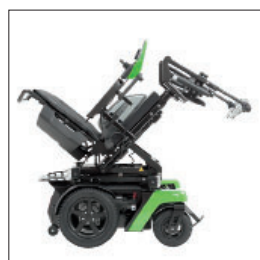
EC025 45° seat tilt