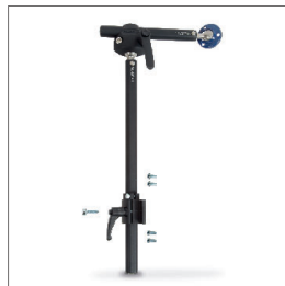
EL003 Multi-axis, straight