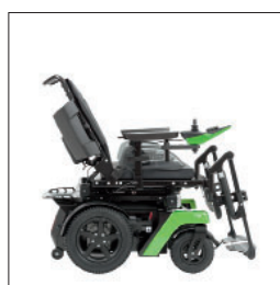
ED047 Power back support angle adjustment