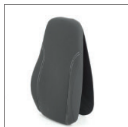
ED050/ED051 Back support pad flat/deep contoured