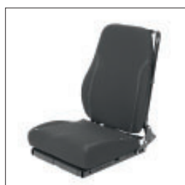
EC020/ED034 Flat contoured