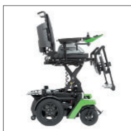
EC026 Seat height adjustment 35 cm