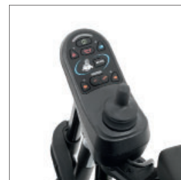
EU058 R-net LED-L