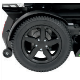
EA010 Splash guard for drive wheels