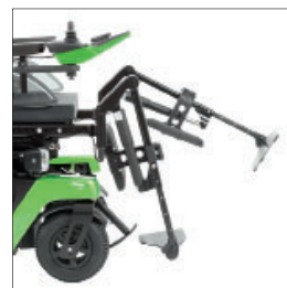
EB003 Power elevating, separate control