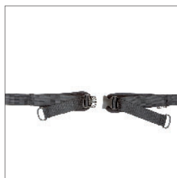
EP003 Lap belt, padded, plastic buckle