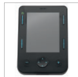
EU054 TEN° LCD module