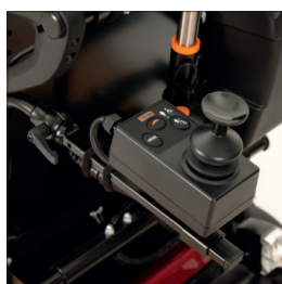
EU057 Attendant control