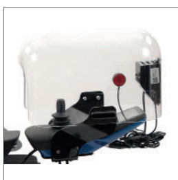
EU095 Hand warmer (single hood for handmodule)