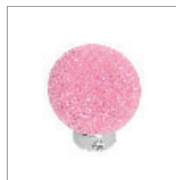
EU085 Soft ball, coloured