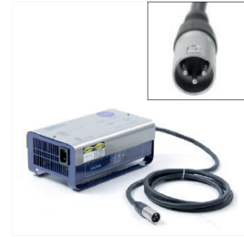
EU046 Battery charger 10 A, with fan