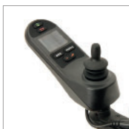
EU064 R-net Colour