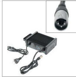
EU044 Battery charger 10 A, fanless