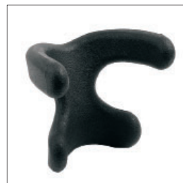
EL015/EL016 Head/neck support, X-shape, small/large