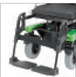
EB012 Individual, plastic foot plates