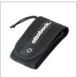
ES003 Pocket for mobile phone