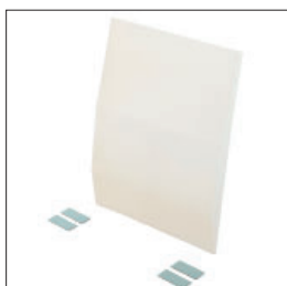
ED040 Lumbar support