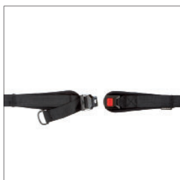
EP002 2-point lap belt, padded, metal buckle