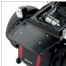
ES004 Luggage carrier