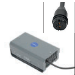
EU042 Battery charger 12 A, incl. external charging recep- tacle