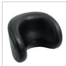
EL013/EL014 Combination head/neck support small/large