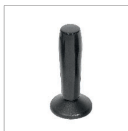
EU081 Stick S80