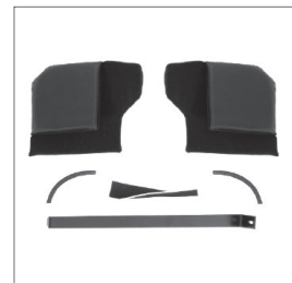
ES013 Dahl mounting kit