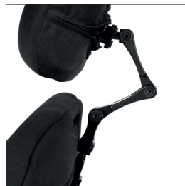
EL031 UniLink multi axis, including seat back mount