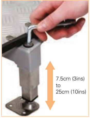
Easy height adjustment and installation from above

All lengths available in Superwide 90cm option: a great bariatric ramp solution and perfect for single outward opening doors, and extra wide mobility devices