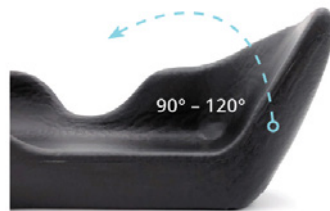
Angle adjustable elbow support