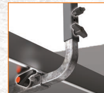
No-Tools assembly kit option