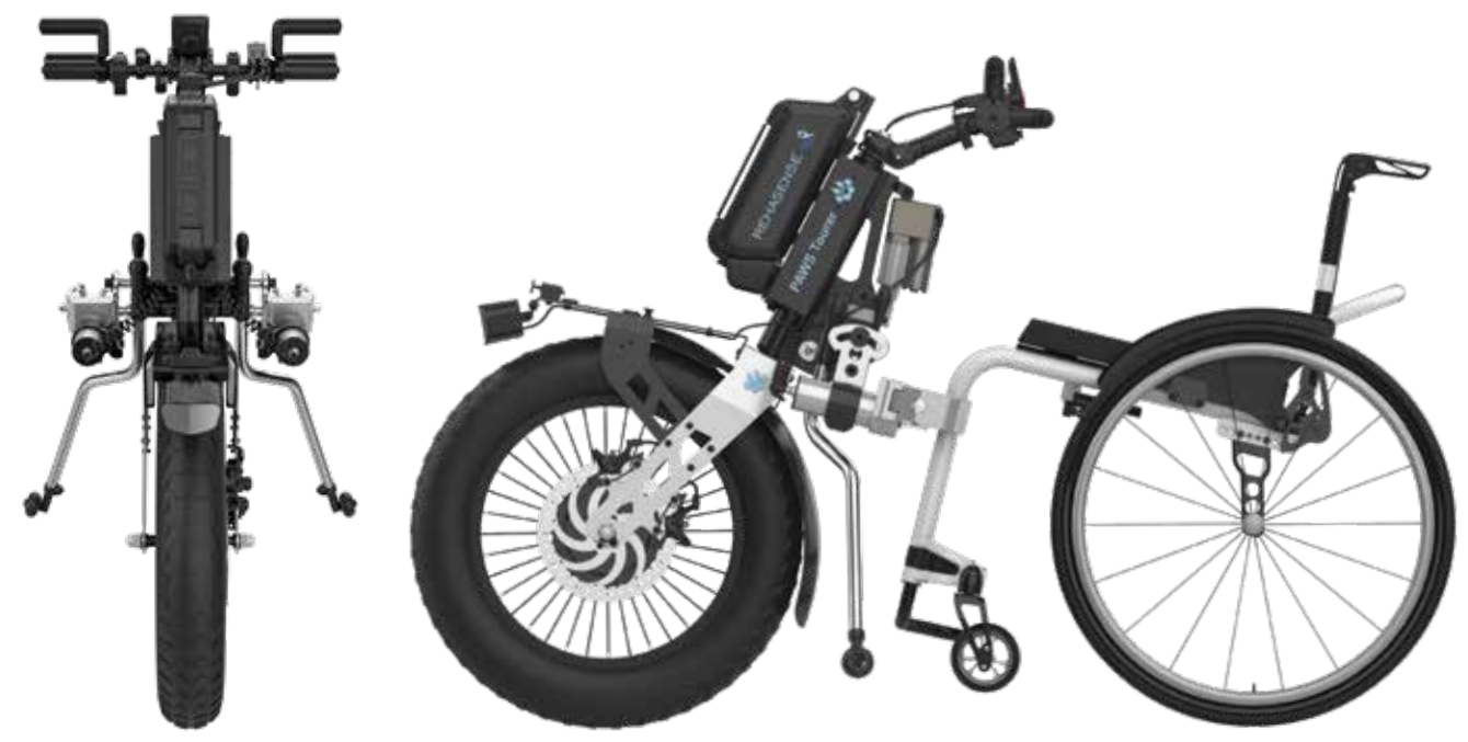
Configuration shown: 20 inch wheel size, Tetra Controls, Automatic Easy Clamps + ICON 60 wheelchair