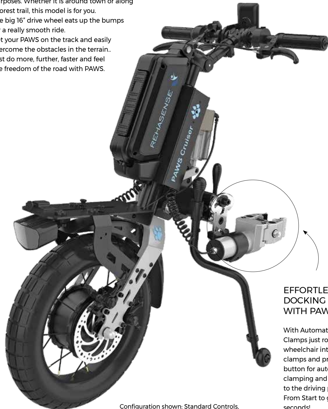
Configuration shown: Standard Controls, Automatic Easy Clamps

Choose PAWS Cruiser and have more fun. A great solution for a variety of mobility purposes. Whether it is around town or along a forest trail, this model is for you. The big 16" drive wheel eats up the bumps for a really smooth ride. Get your PAWS on the track and easily overcome the obstacles in the terrain.. Just do more, further, faster and feel the freedom of the road with PAWS.