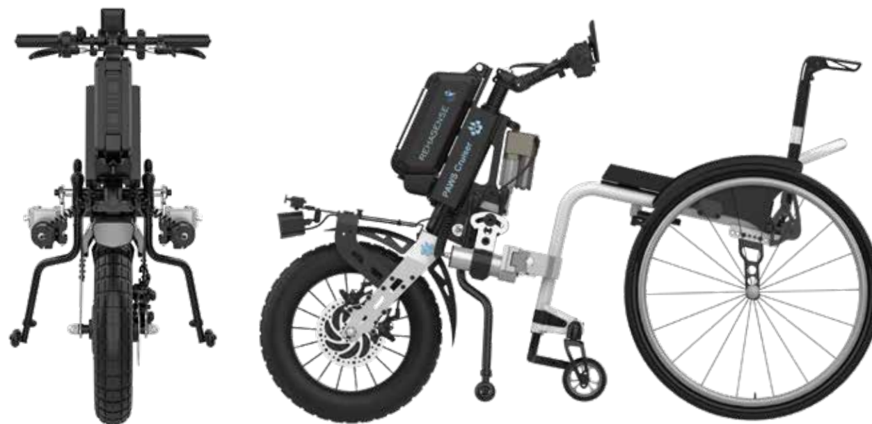
Configuration shown: 16 inch wheel size, Standard Controls, Automatic Easy Clamps + ICON 60 wheelchair