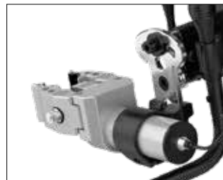
Automatic Clamps for effortless engaging