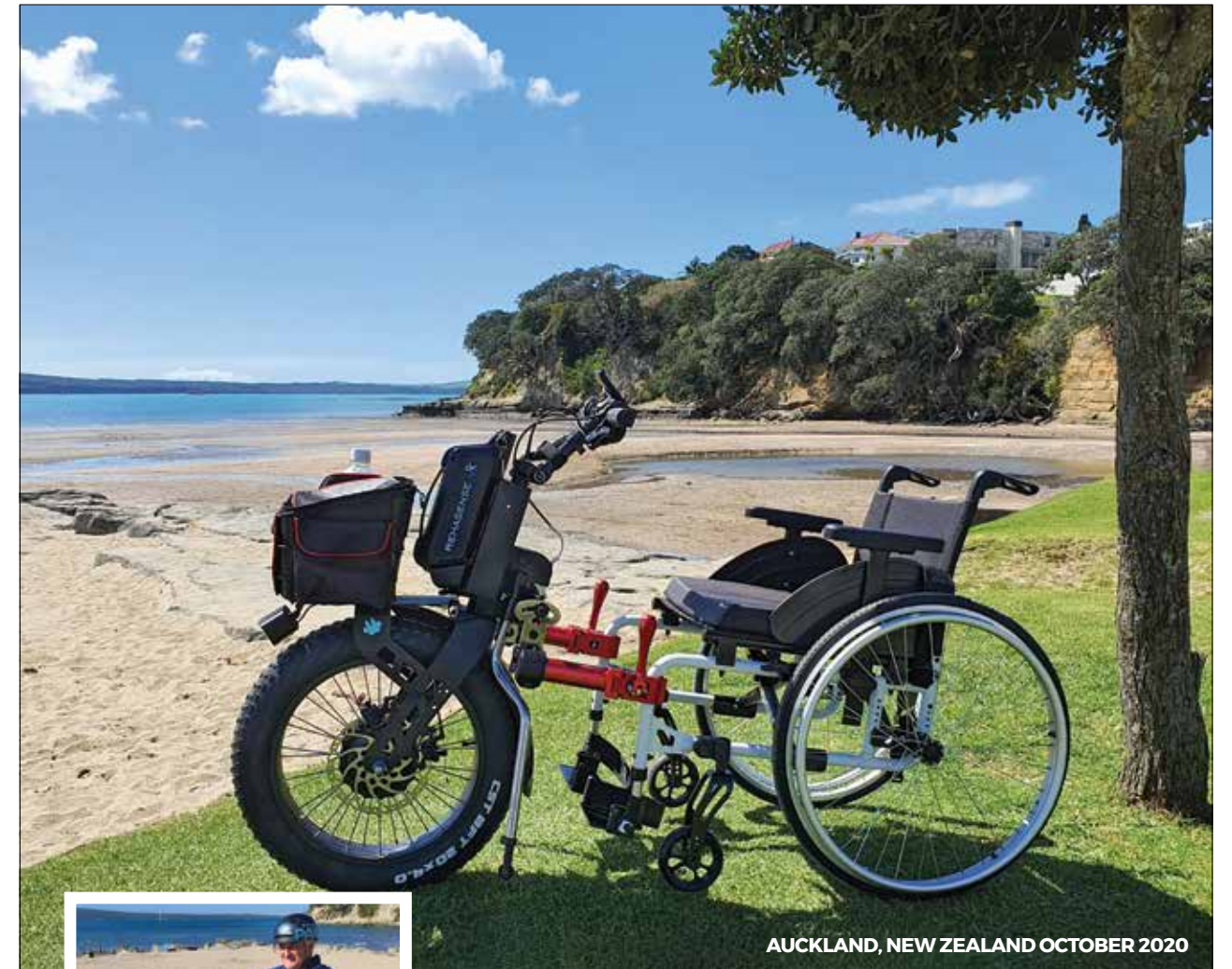
AUCKLAND, NEW ZEALAND OCTOBER 2020

Special Tetra handles with braking brake Full control without exertion