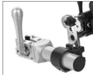
Manual Clamps with long levers for easy engaging

It is very easy to connect the PAWS to the wheelchair, with two innovative choices of Easy Clamps – Manual or Automatic. Another unique feature of the PAWS is that you do not need any wheelchair modifications or add-ons to connect both. After using PAWS, your wheelchair remains as it is. All you add is PAWS!