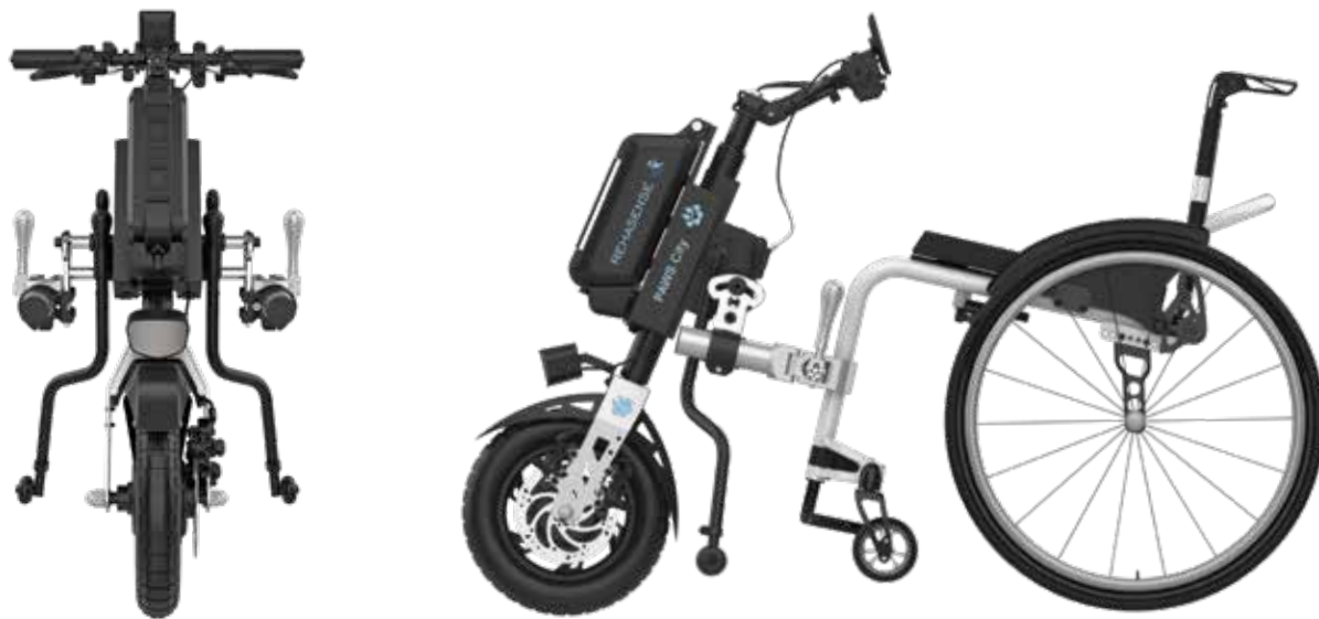
Configuration shown: 12" wheel size, Manual Controls, Manual Easy Clamps + ICON 60 wheelchair